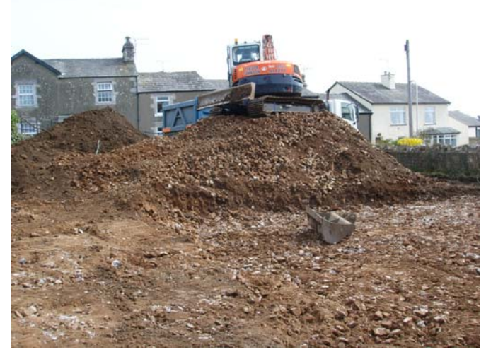
Plate 2 (left): West part of the site viewed from the south-east Plate 3 (right): Looking east across the site