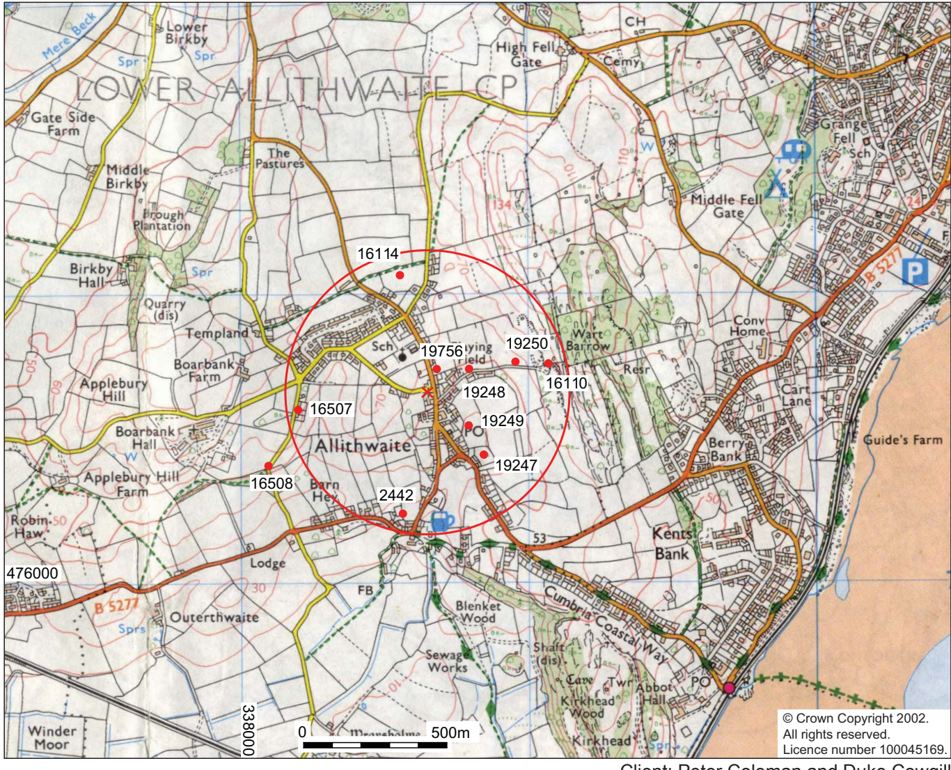
Figure 1: Site location and gazetteer