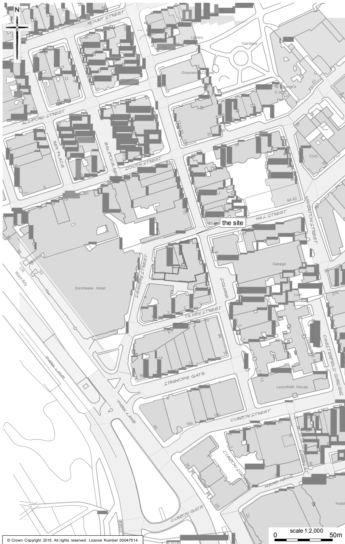
Fig 1 Site location