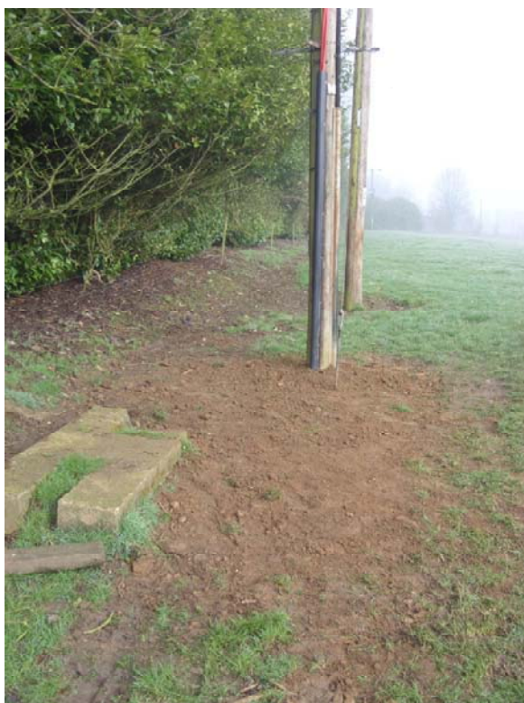
The reinstated trench, looking east Fig 2

The field in which the works took place contains the earthworks of ridge-and-furrow cultivation. It is close to the hedge boundary with a modern house-plot (Park Farm), beyond which the ground has been cultivated in recent times and is very slightly higher and flatter (Fig 2). It lies at the very northern end of the DMV earthworks.