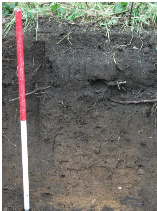
Topsoil and subsoil deposits in the development area, looking south: Fig 3

The maximum depth of the groundworks was 1.00m below the modern ground surface. The underlying geology of clay and mudstones was observed throughout the development area and was overlain by 0.20-0.40m of mid orange-brown sandy clay subsoil, which was overlain by 0.30-0.60m of dark black-brown sandy clay topsoil. No archaeological features were present within the development area and no finds were recovered.