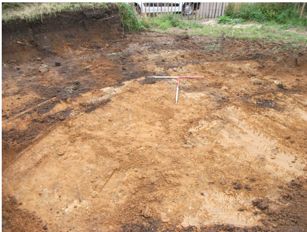
The excavated development area, looking south-west: Fig 4