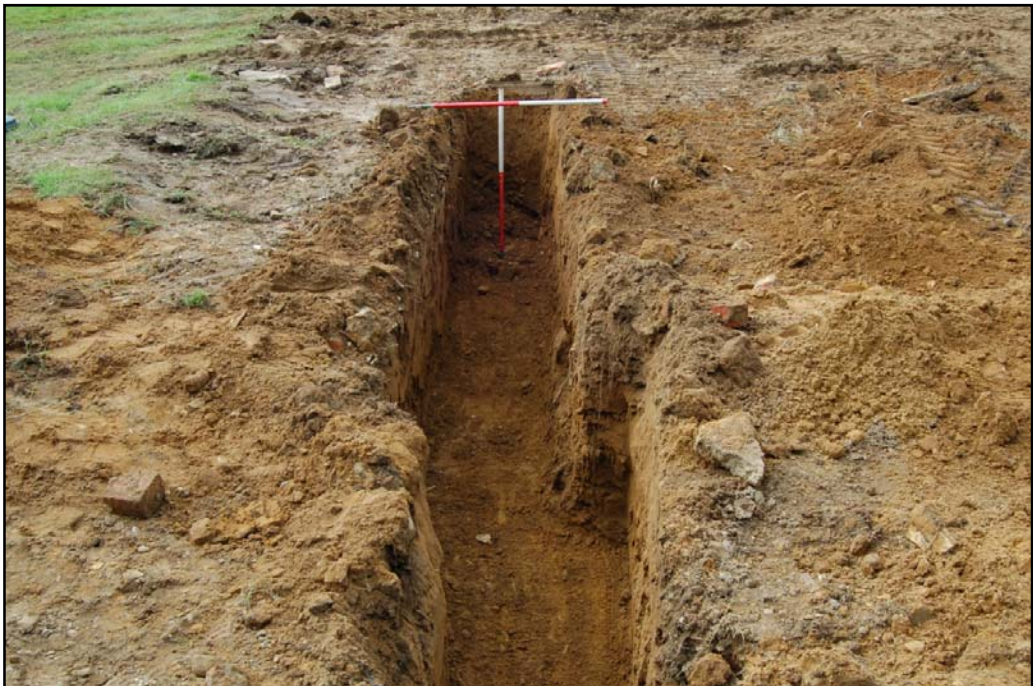
Redeposited material, looking west Fig 4

In the northern and eastern part of the site the ground was heavily disturbed by drains, services and wall footings. Above the natural geology was a layer of re-deposited material, the layer comprised gravel, bricks and other construction material, it covered the area to a depth of approximately 0.5m (Fig 4).