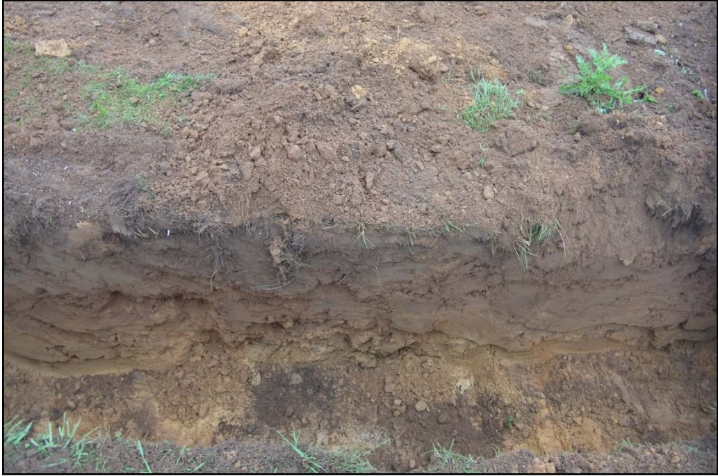
Undisturbed stratigraphy, looking west Fig 3

In the western and south-western corner of the foundation trench undisturbed ground revealed natural geology comprising orange-brown Northamptonshire Sand with ironstone. This was overlain by subsoil approximately 0.3m thick (Fig 3).