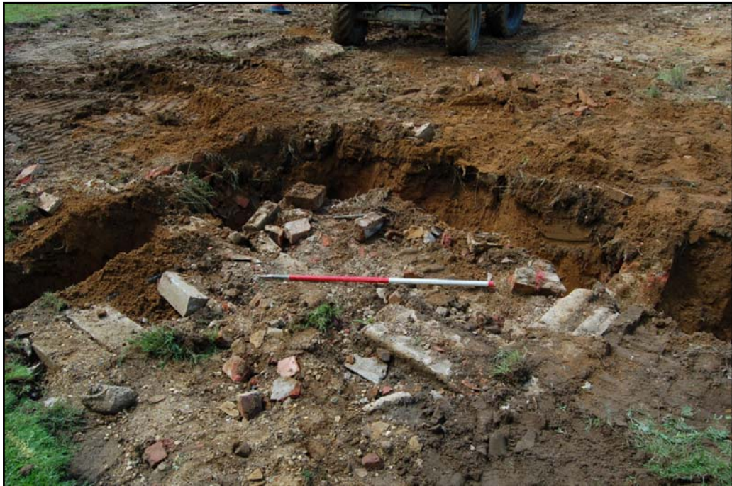
Wall foundations from the old Pavilion, looking north-west Fig 5

The wall footings of the previous Pavilion sat on top of the natural geology( the subsoil had been removed during construction). Topsoil was approximately 0.25m thick (Fig 5).