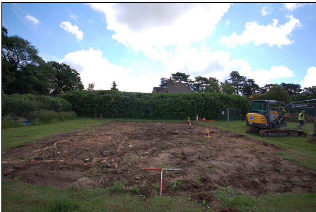
The investigation area, looking east Fig 2

The area outlined for development had been stripped of topsoil prior to arrival. Further work was carried out under continuous archaeological observation by a qualified and experienced archaeologist. The groundworks comprised foundation trenches forming a rectangle 14.5m east to west and 10m north to south, with internal trenches. The groundworks were carried out using a mechanical excavator fitted with a 0.7m bucket, a combination of toothless and toothed buckets was used. The foundation trenches were dug to a maximum depth of approximately 1.2m below present ground level.