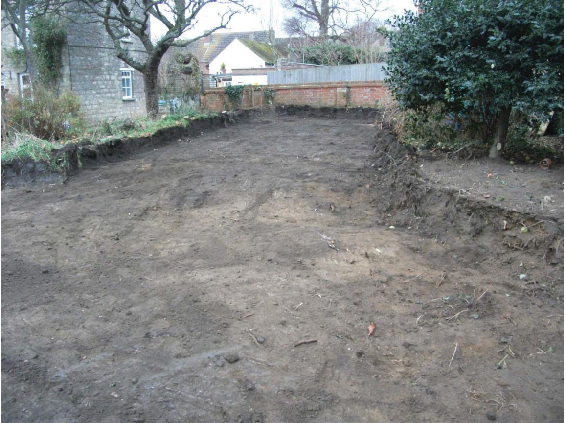
The access road during groundworks, looking north Fig 6