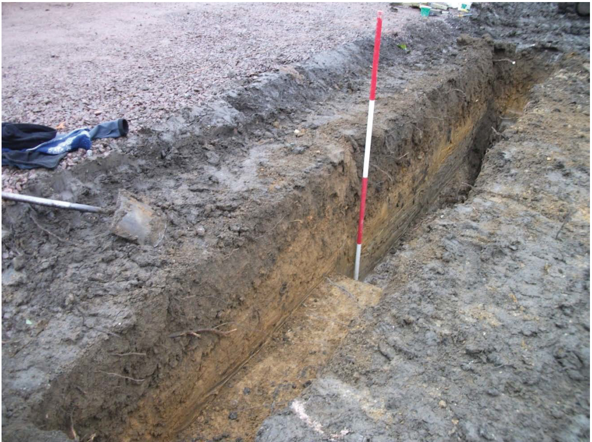
The stratigraphic sequence in the foundation trenches Fig 7