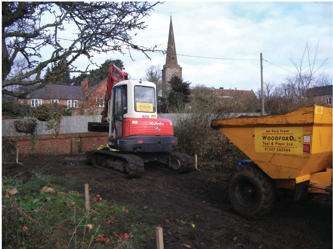
The Church of St Bartholomew to the north of the investigation area Fig 4