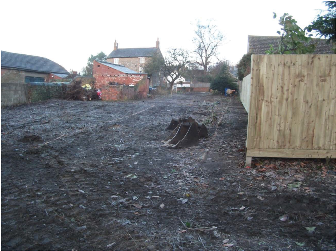
The investigation area prior to the start of groundworks, looking north-west Fig 3