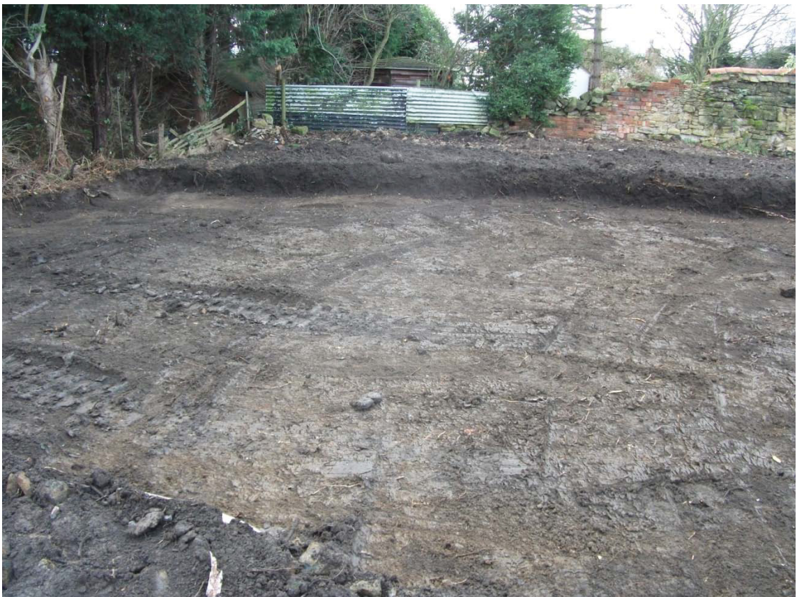
The investigation area during the topsoil strip, looking south-west Fig 5

No archaeological deposits or artefacts were present.