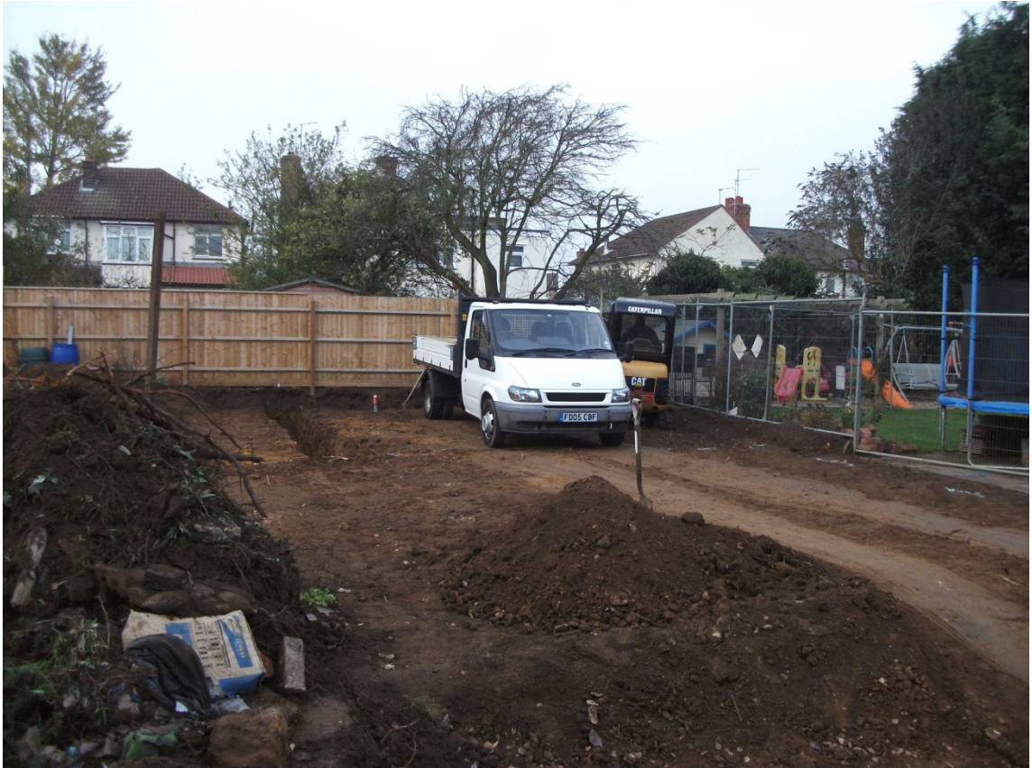
The area of the double garage, looking north Fig 5

No archaeological deposits or artefacts were present.