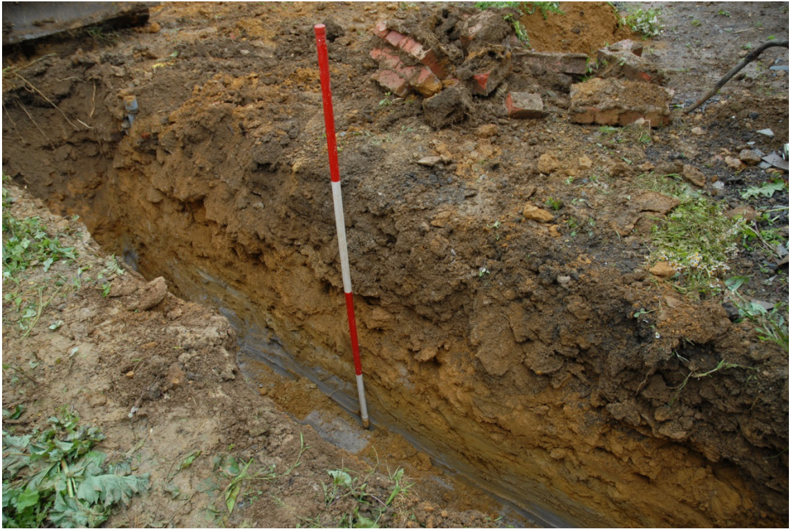
The stratigraphic sequence Fig 6