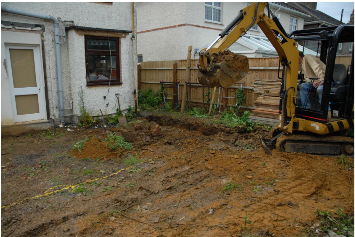
General view of the groundworks, looking south-west Fig 4