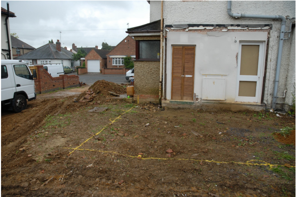
111 Neale Avenue and the area of the new extension, looking south Fig 3