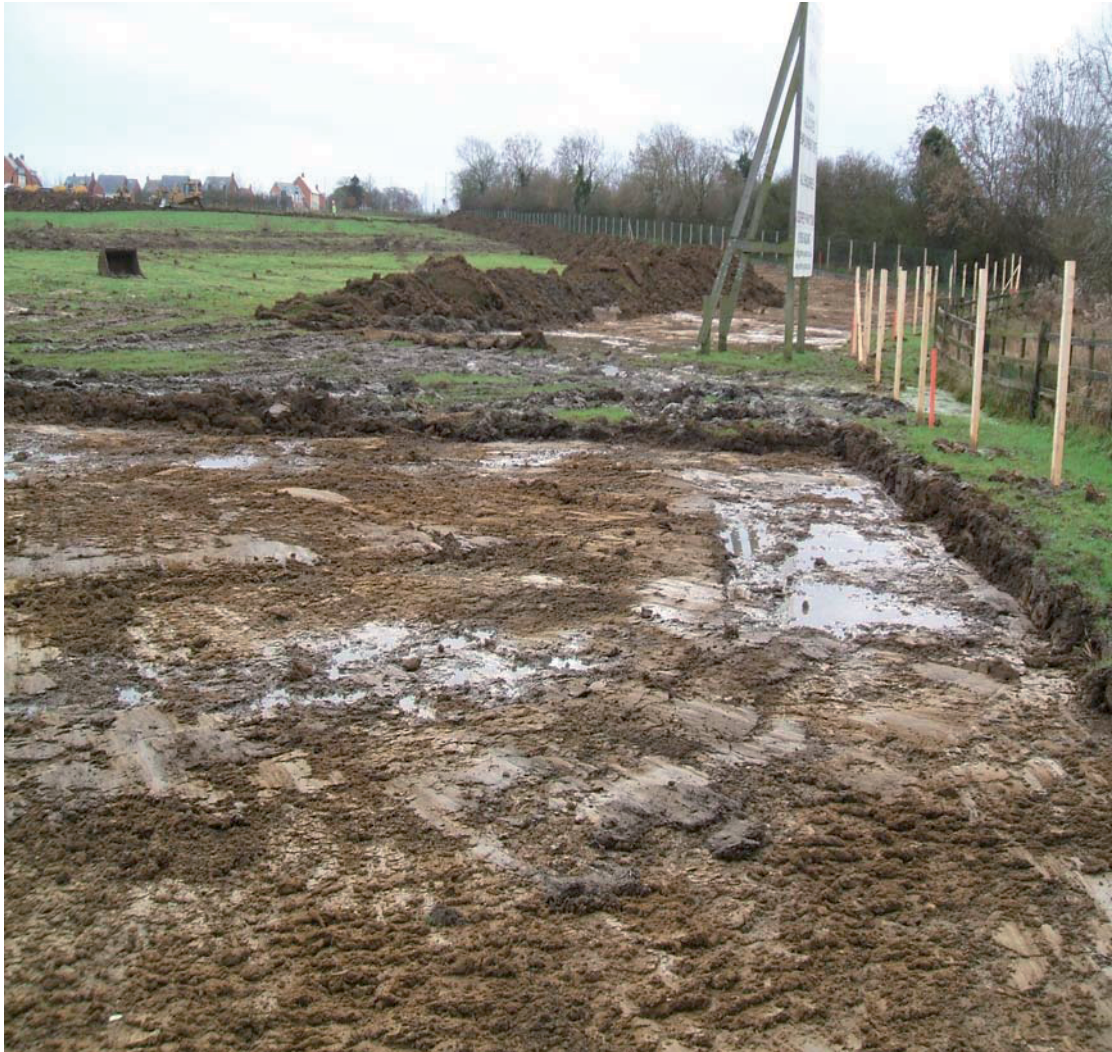
Plate 5 West side of area looking south