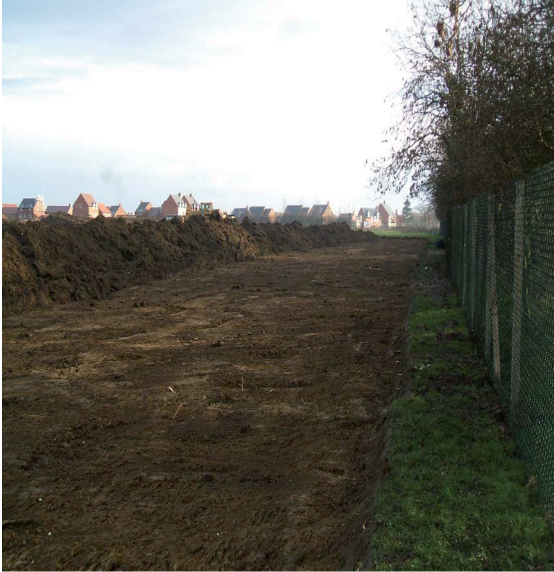
Plate 3 South side of area looking east