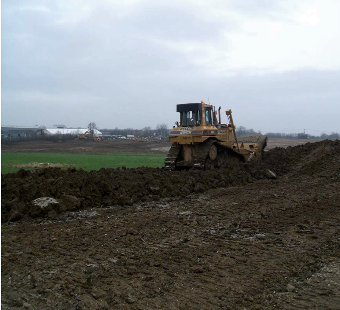
Plate 2 South side of area looking north east