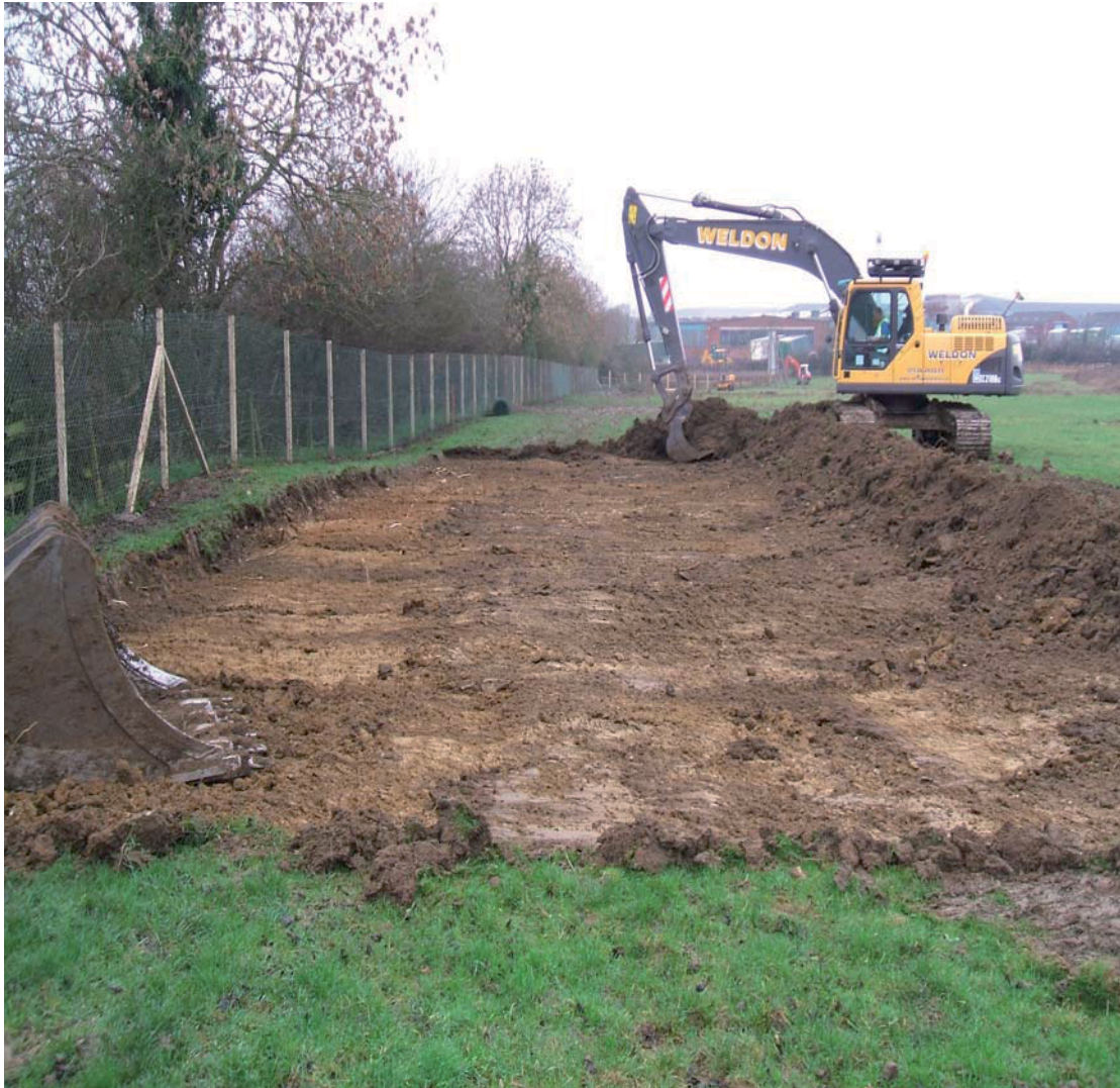
Plate 1 South side of area looking west