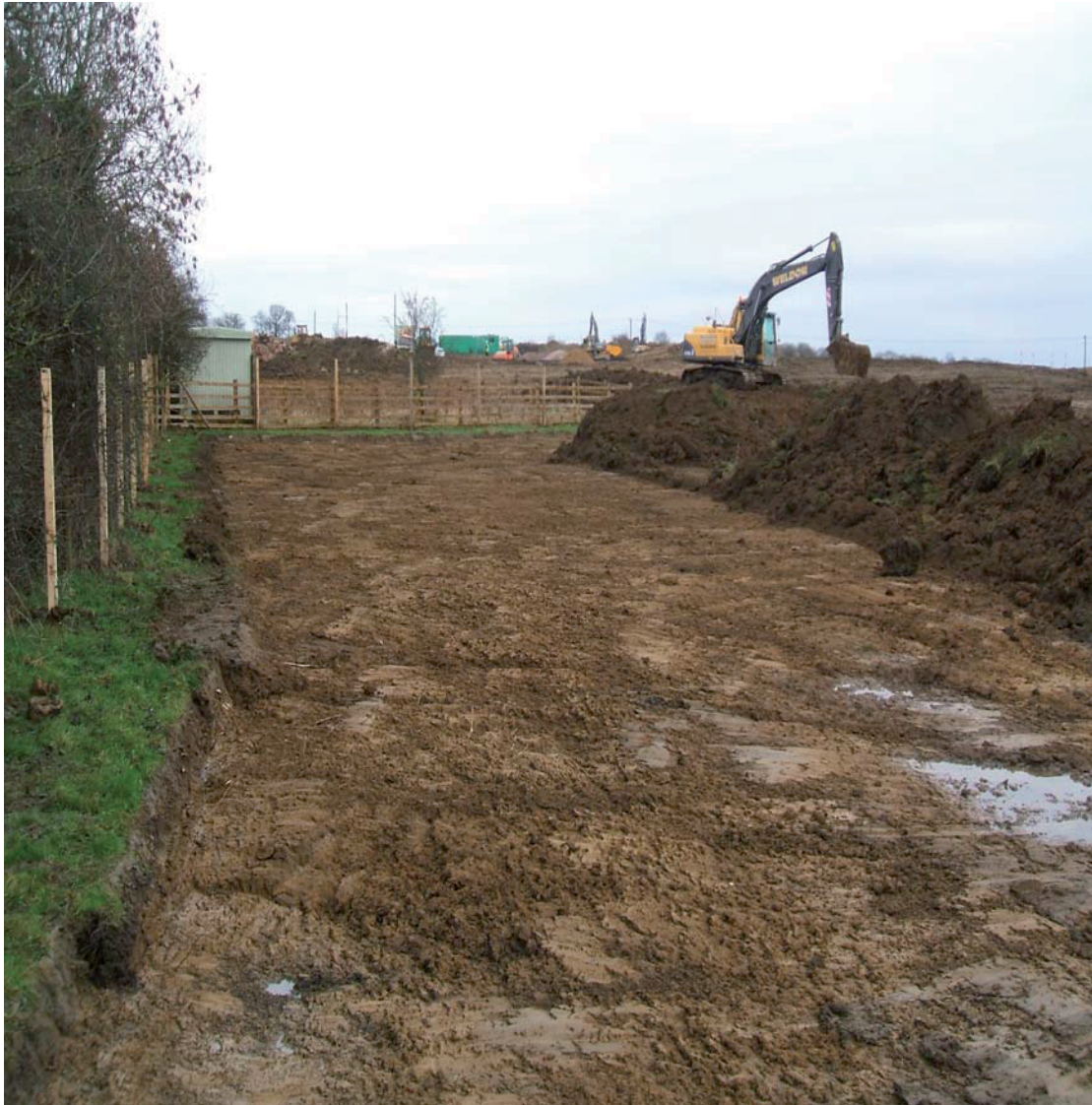
Plate 4 West side of area looking north