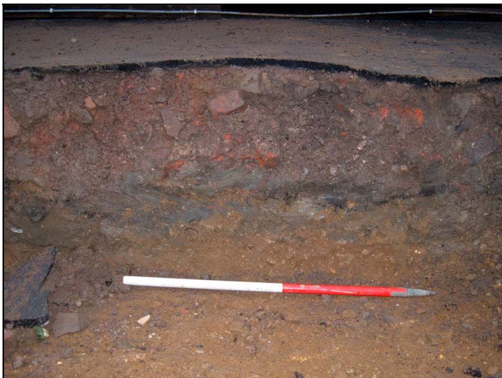
Plate 2: Section in area of former car park area, looking south