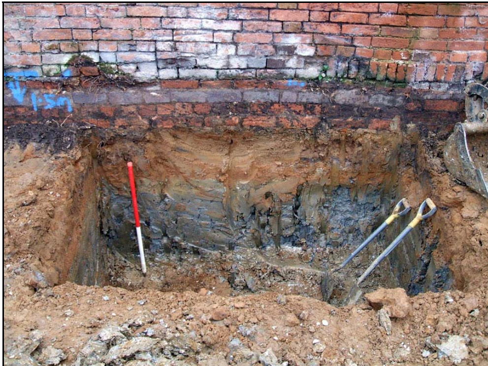
Plate 1: Northern boundary wall, looking north