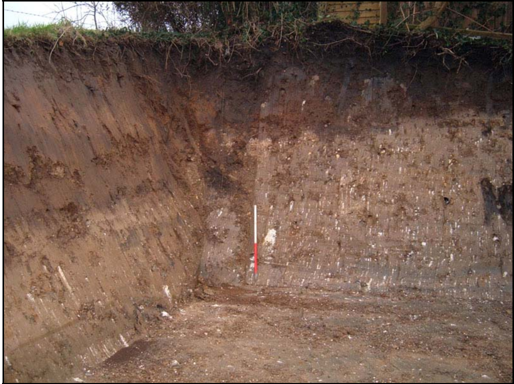
Plate 3: South-east corner of development area, looking south