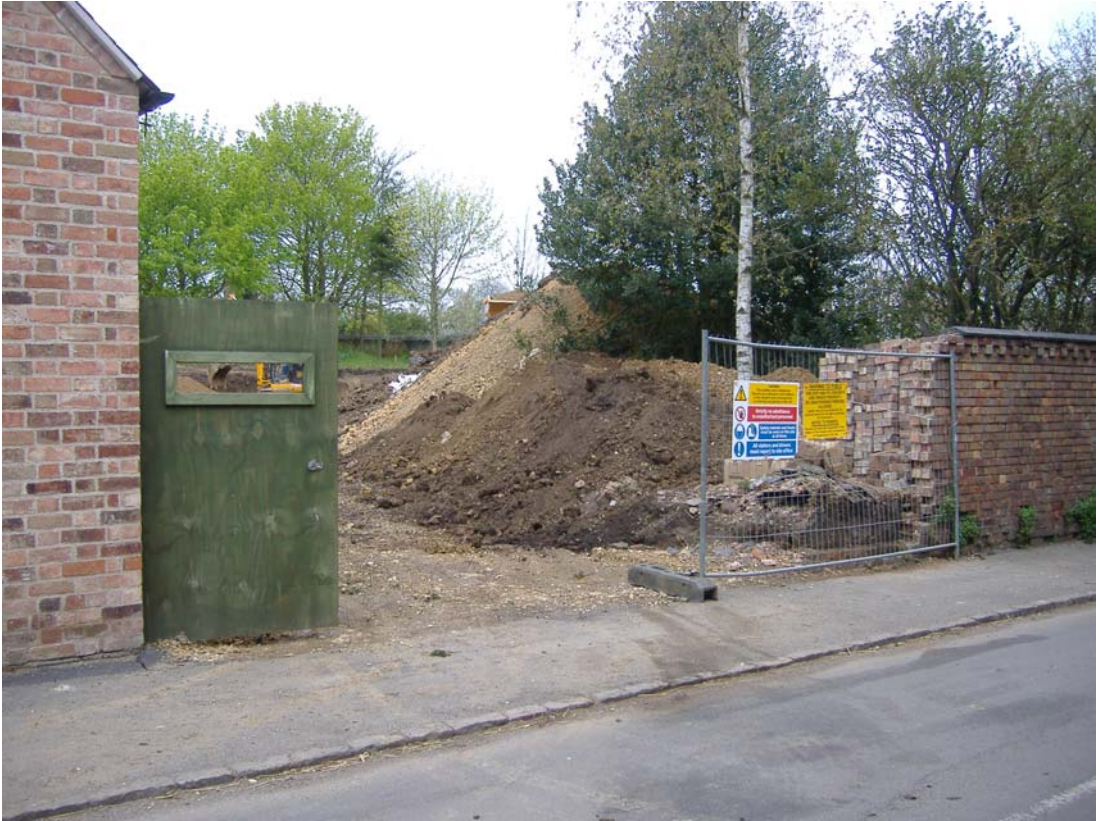
Plate 1: View from Main Street into the development area