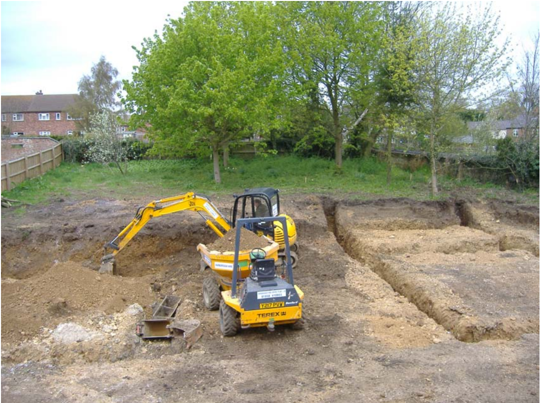
Plate 2: The foundation trenches during excavation