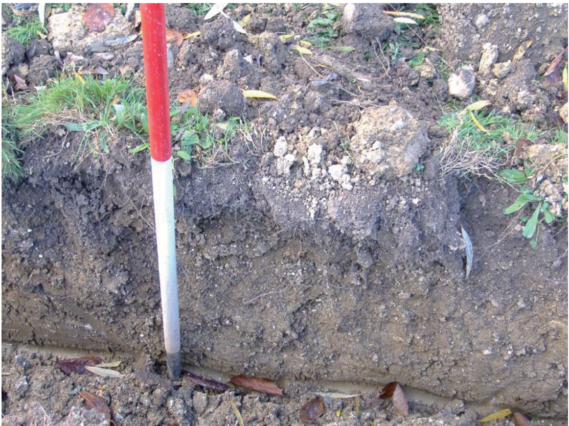
Plate 4: The stratigraphic sequence within the service trench