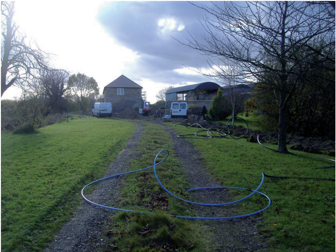
Plate 1: General view of the development area