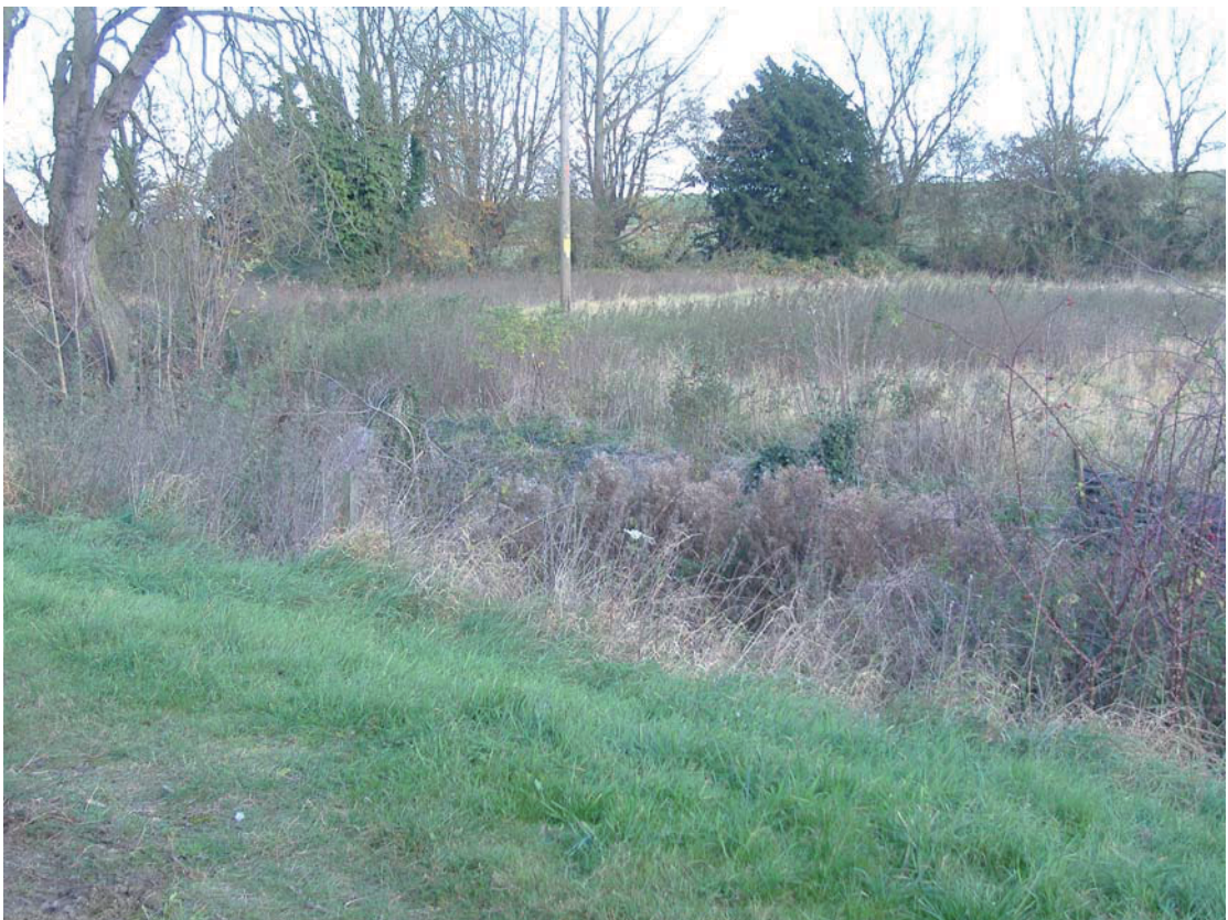
Plate 2: View across to Great Lodge Moated site