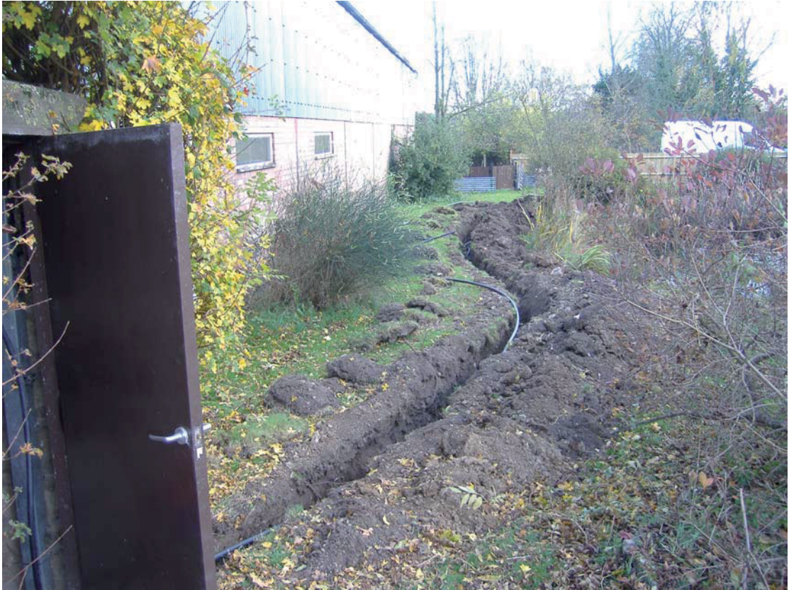
Plate 3: The service trench at its northern termination