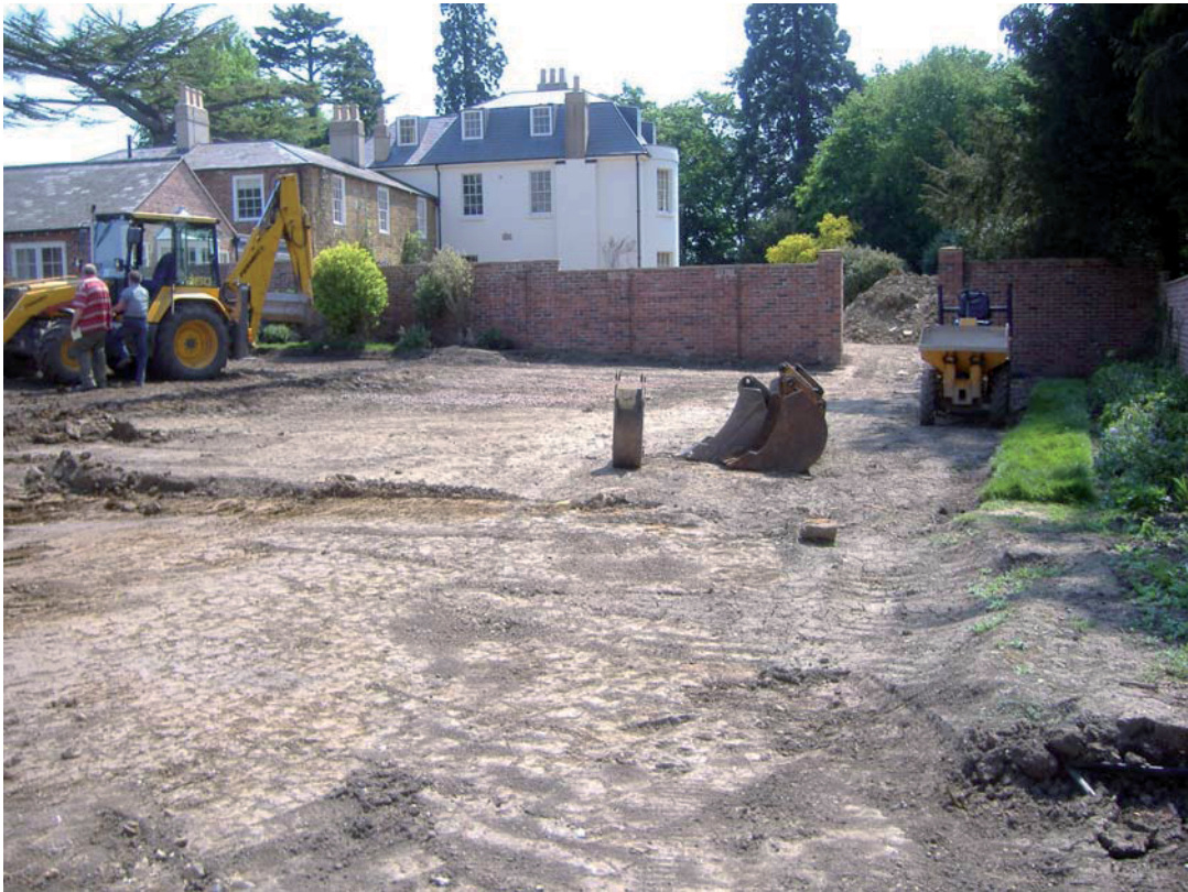
Plate 1: General view of the Old Rectory and the area of development