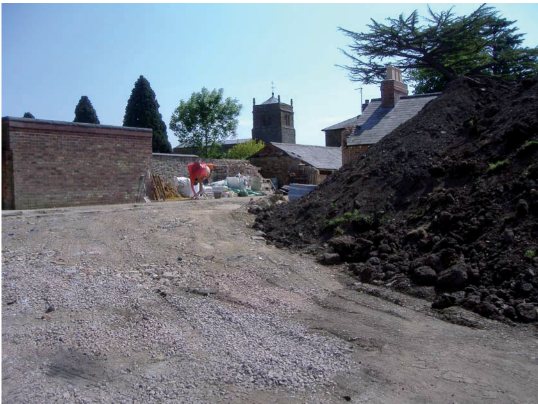
Plate 2: The development area and All Saints Church