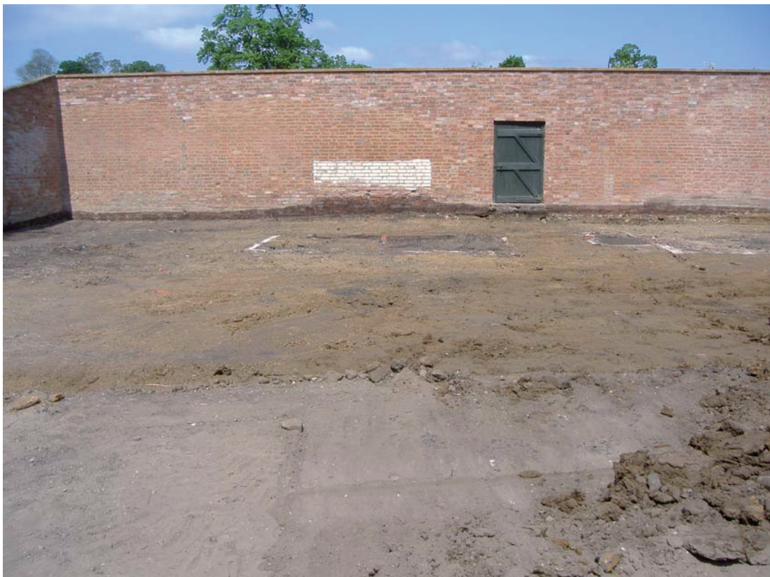
Plate 4: The development area during groundworks, with the bases of the old greenhouses to the rear of the plot