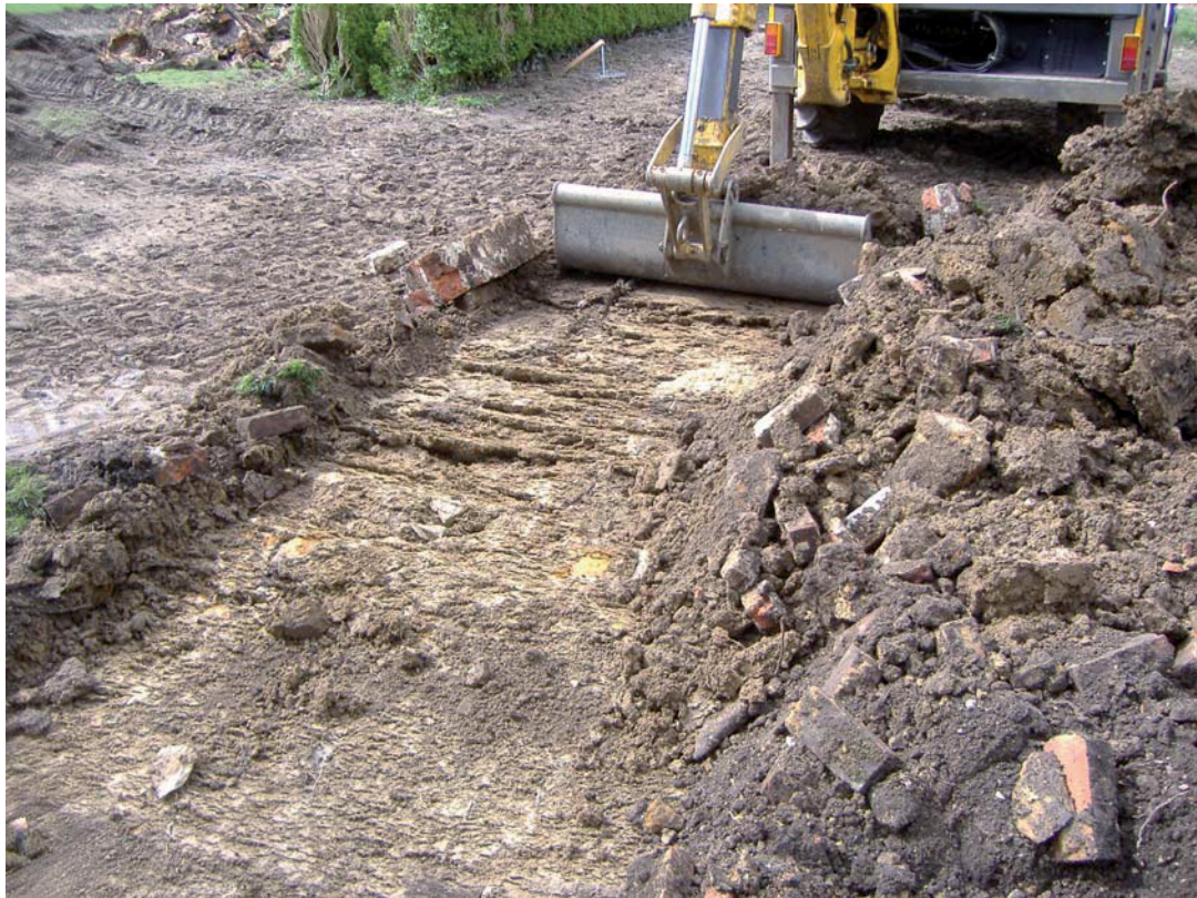
Plate 3: Groundworks in progress