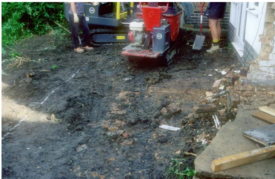
Plate 2: The development area during groundworks