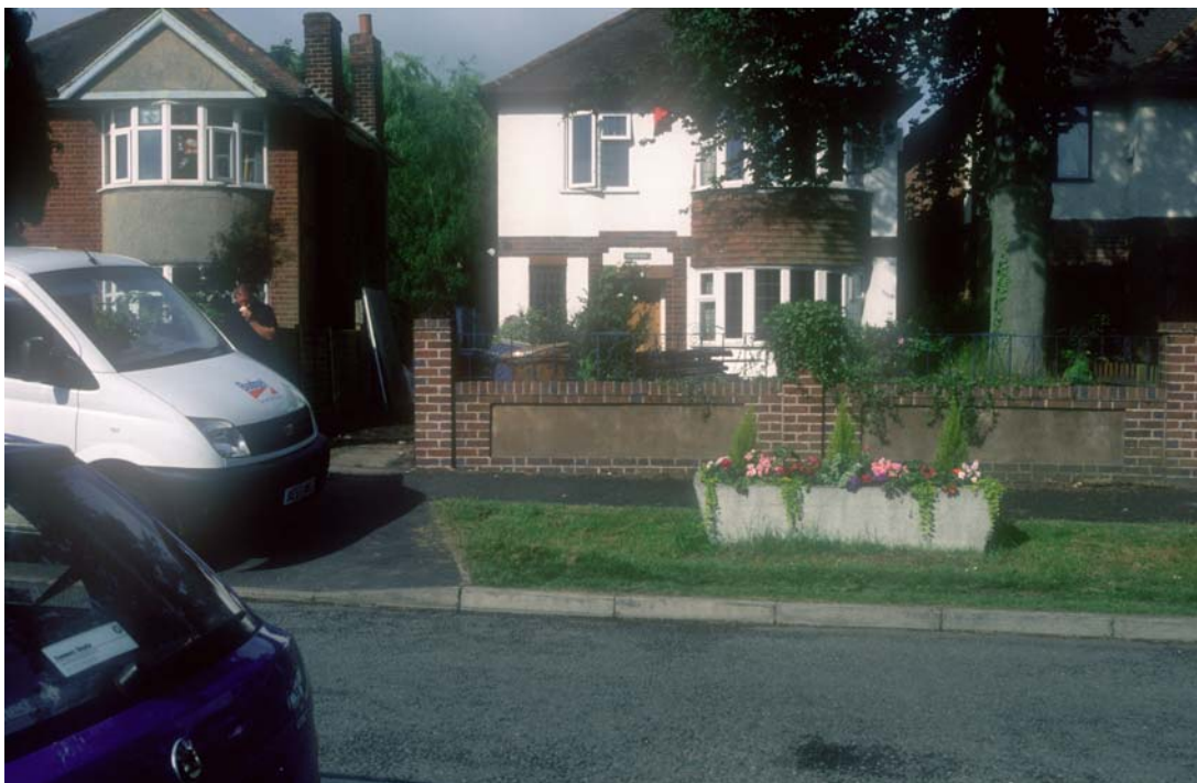
Plate 1: Parkstone, Stoke Golding