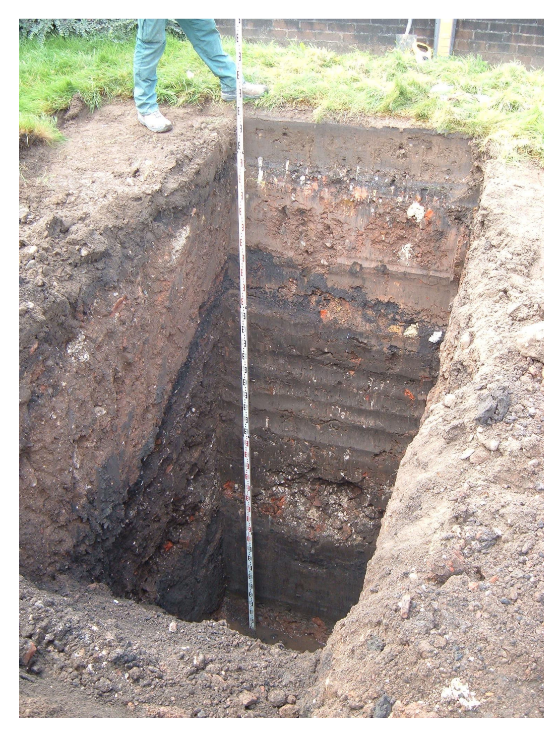
Plate 2: Western end of Trench 2, showing depth; facing west