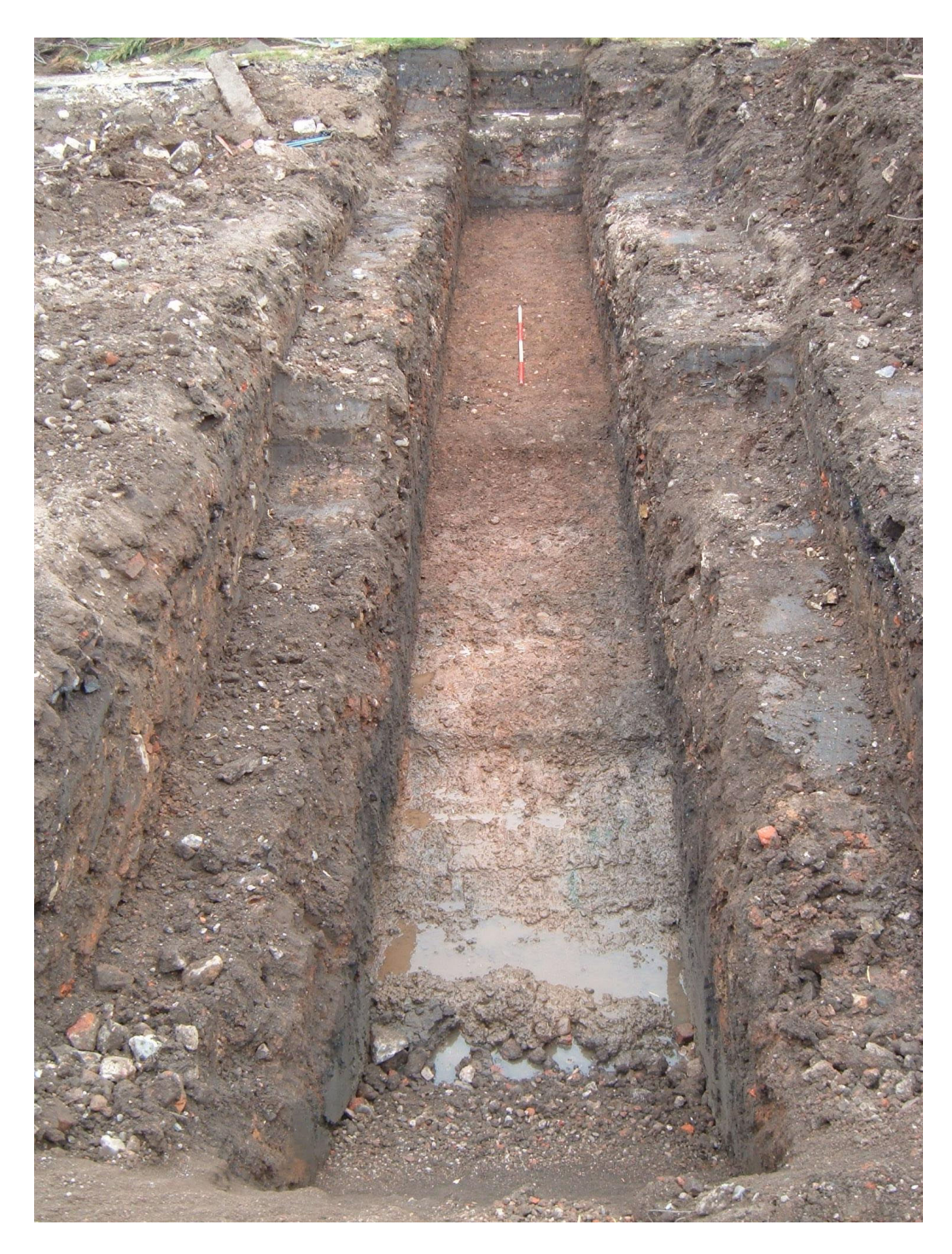
Plate 4: Trench 3, facing south