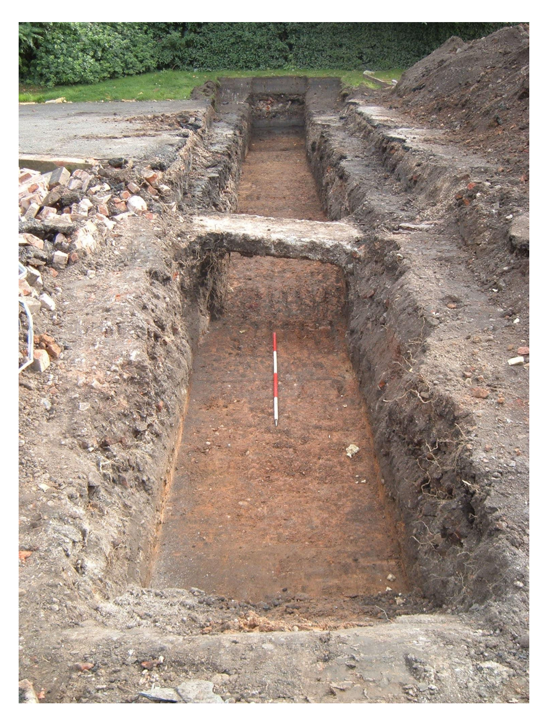
Plate 1: Trench 1, facing south