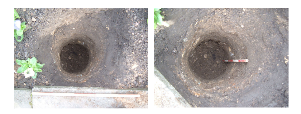
Plates 7 and 8: Pit 2 on Completion