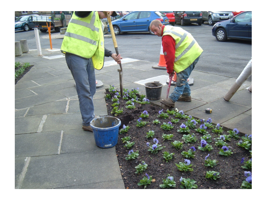
Plate 4: Pit 1 (left) and Pit 2 (right), Under Excavation