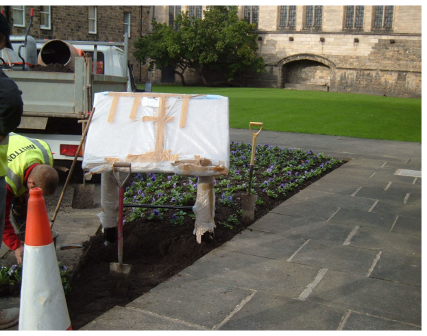
Plate 3: The Site After Works