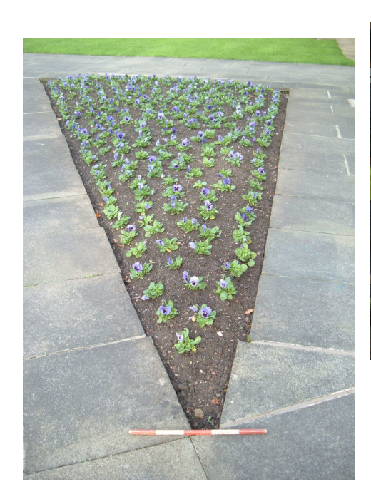
Plate 2: The Site Prior to Works