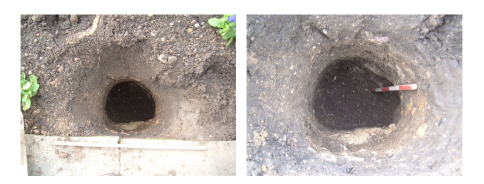
Plates 5 and 6: Pit 1 on Completion