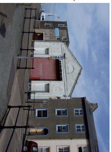
View of Buildings E, F and G from south