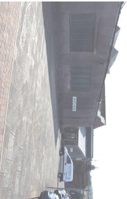
View of Buildings C, D and E from north