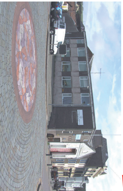
View of Buildings E, F and G from west