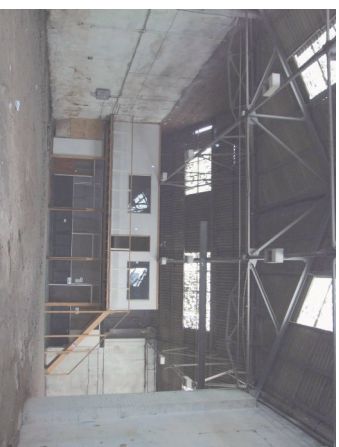
View of Inside of Building F, from south-west