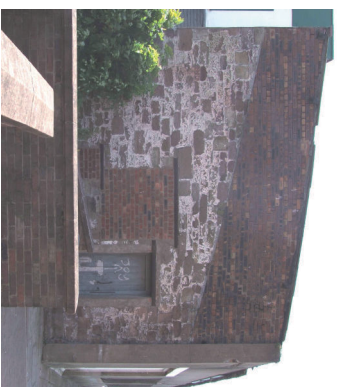
View of Building A from north-east