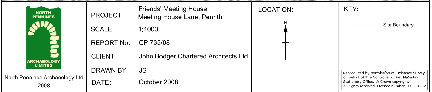
Figure 14: Ordnance Survey Map 1988