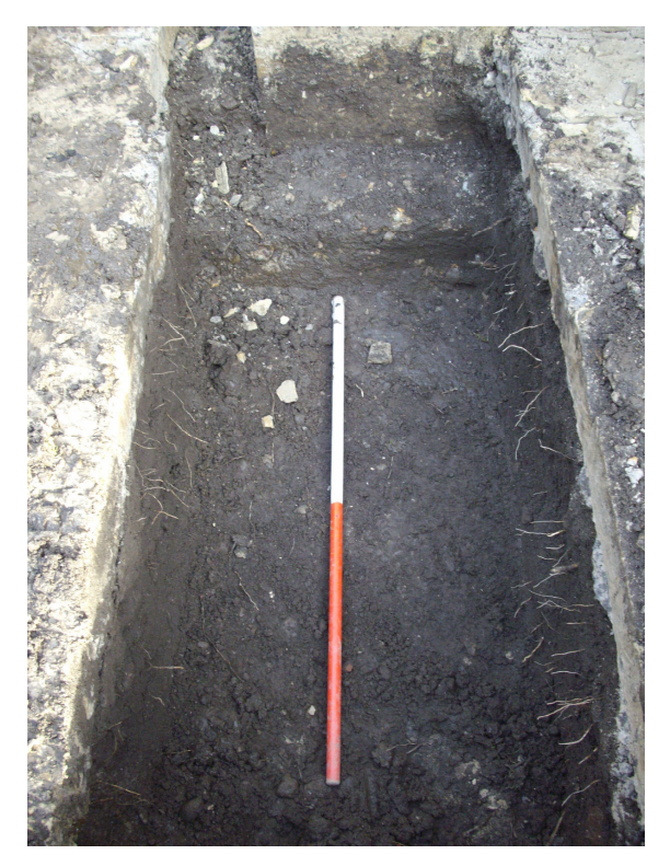
Plate 1: Foundation Trench No. 1, facing north.

4.2.1 The groundworks commenced at the area to the south of the farmhouse. The smaller foundation trench was excavated first. This was 0.64m in width, 1.40m in length and had a depth of 0.52m. The stratigraphy in this area consisted of a dark blackish brown silty clay (101) with small stone inclusions, which was excavated to a depth of 0.41m. This was a substantial backfill layer laid down in order to landscape the area prior to construction of the patio area. This lay below the modern patio surface (100), this was made from concrete which had a depth of 0.11m. No archaeology was observed and no finds were recovered.