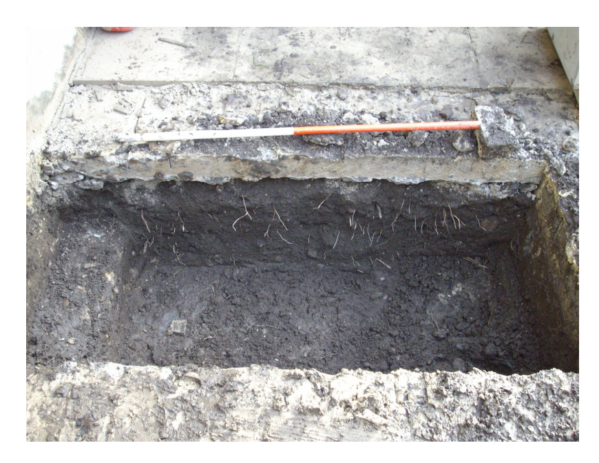
Plate 2: Section of Foundation Trench No. 1, facing east