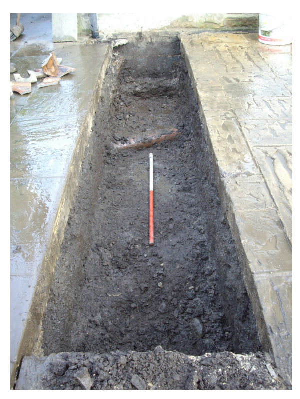
Plate 3: Foundation Trench No. 2 fully excavated, facing north.