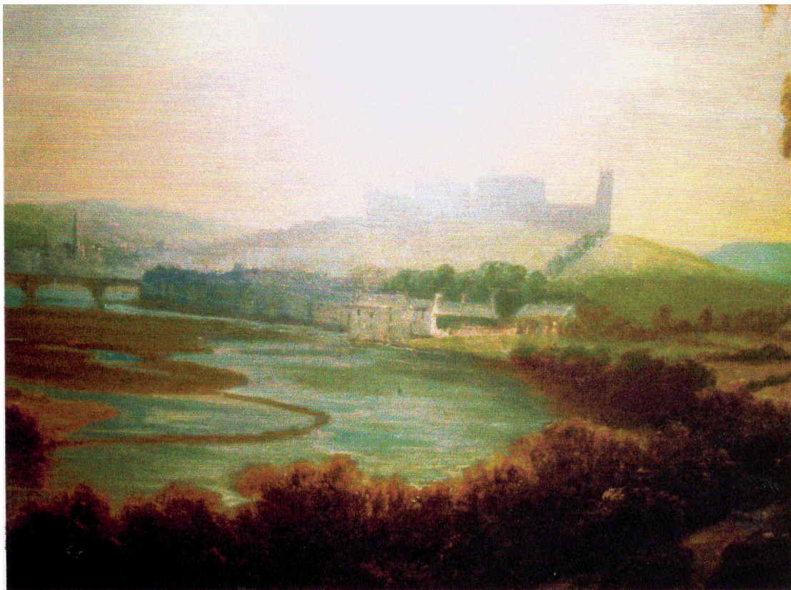
LUNESIDE IN THE EARLY 19 TH CENTURY