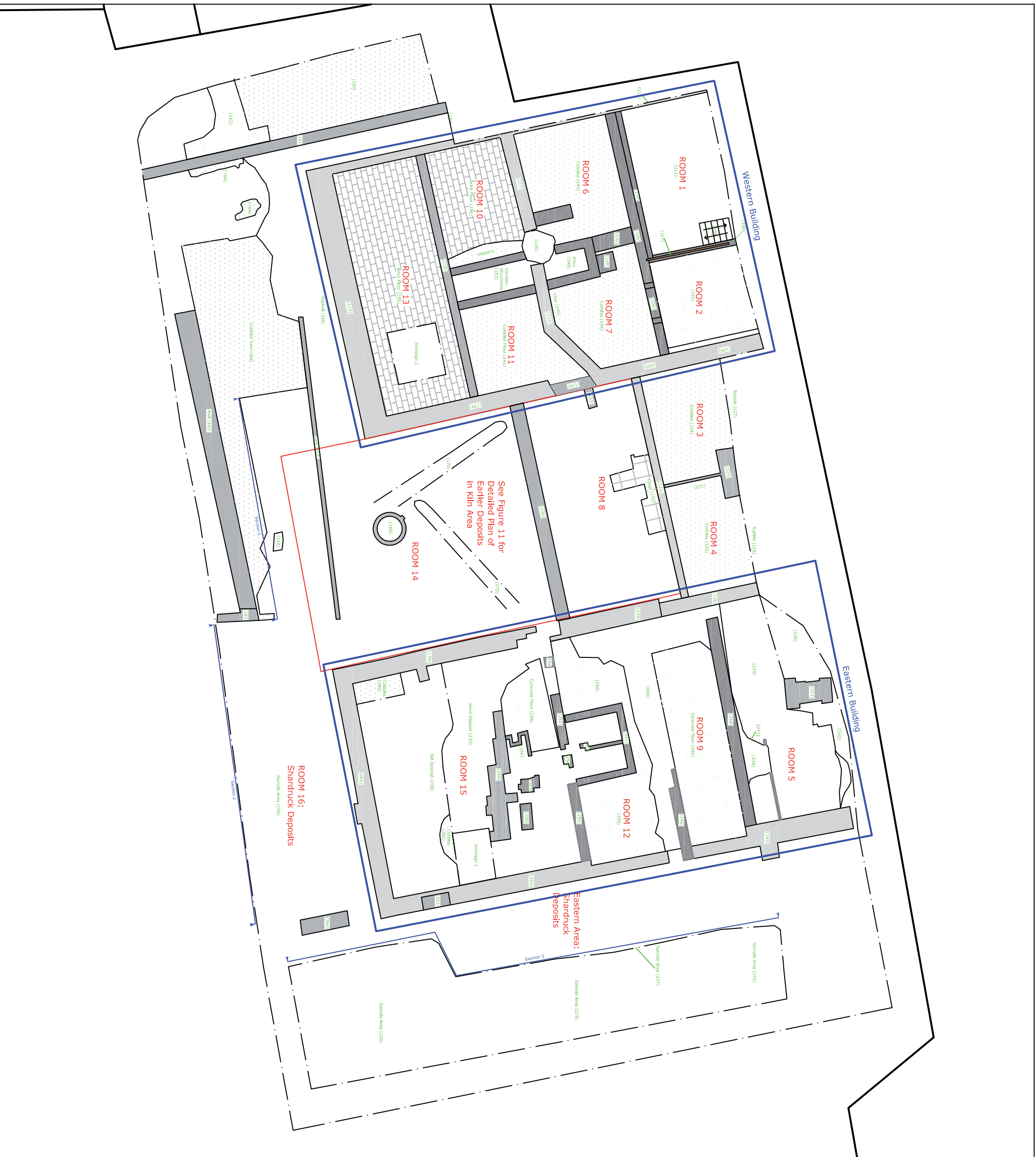
Figure 10: Outline Site Plan