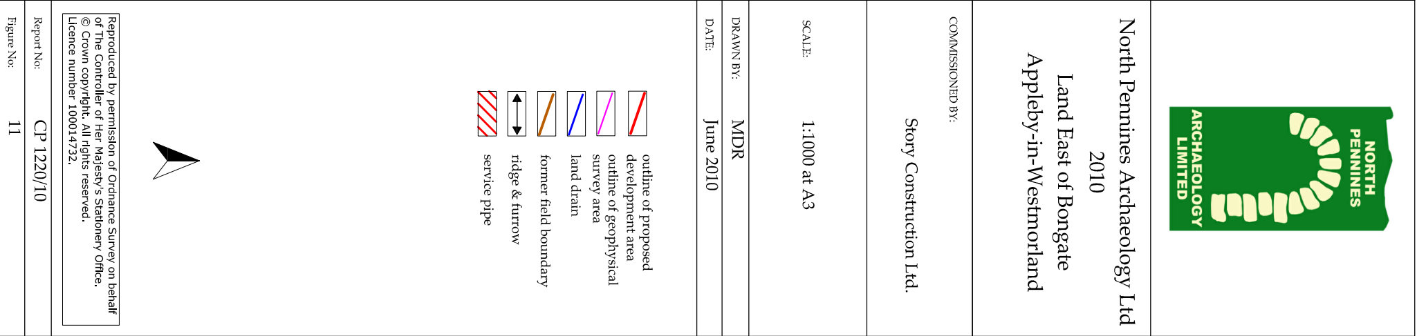
Figure 11 : Archaeological Interpretation of Area 1