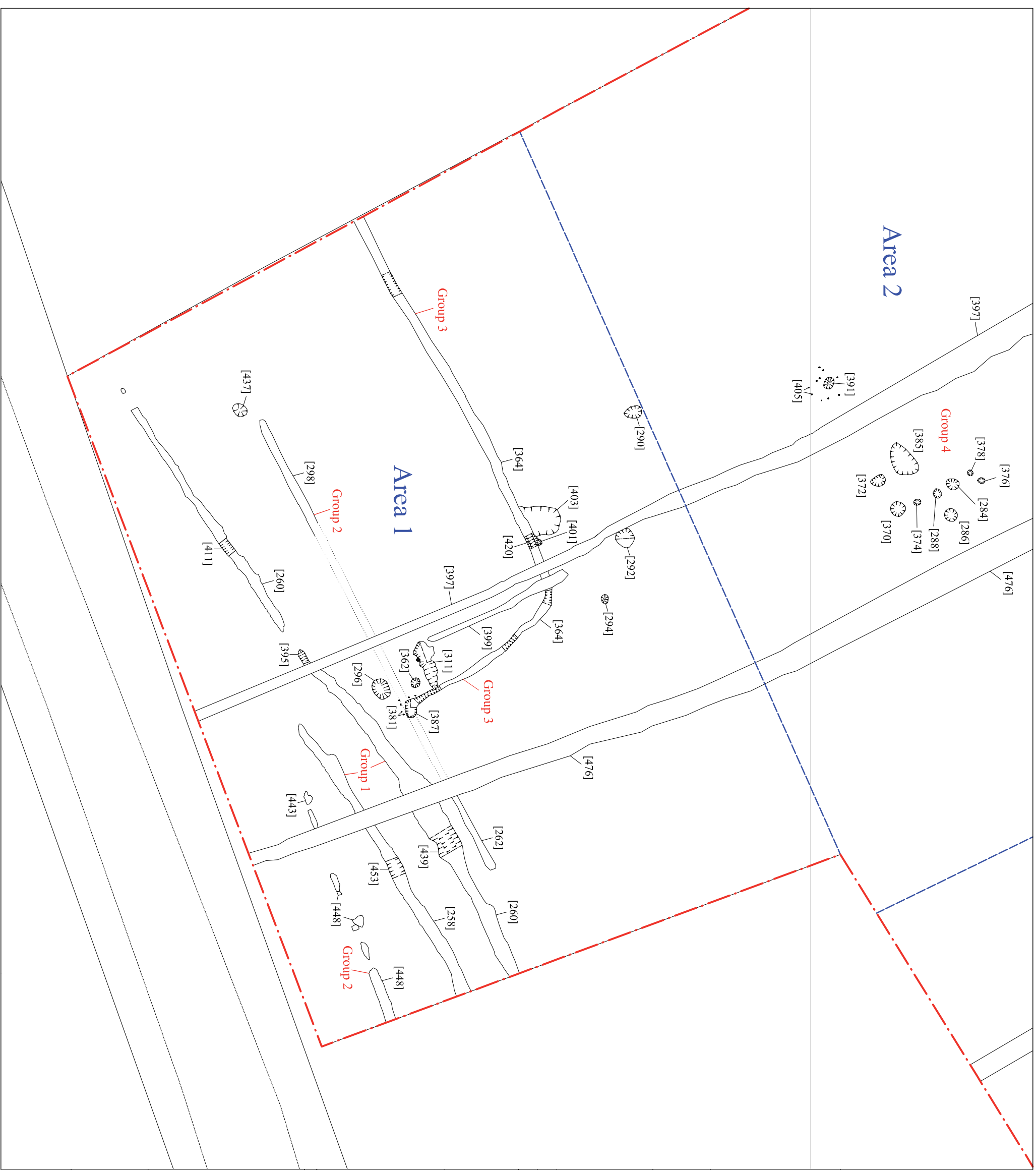
Figure 4 : Plan of archaeological features in Area 1

COMMISSIONED BY: Thomas Armstrong (Holdings) Ltd