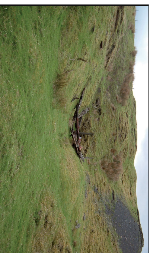
Remains of entrance to Prior High Side Drift