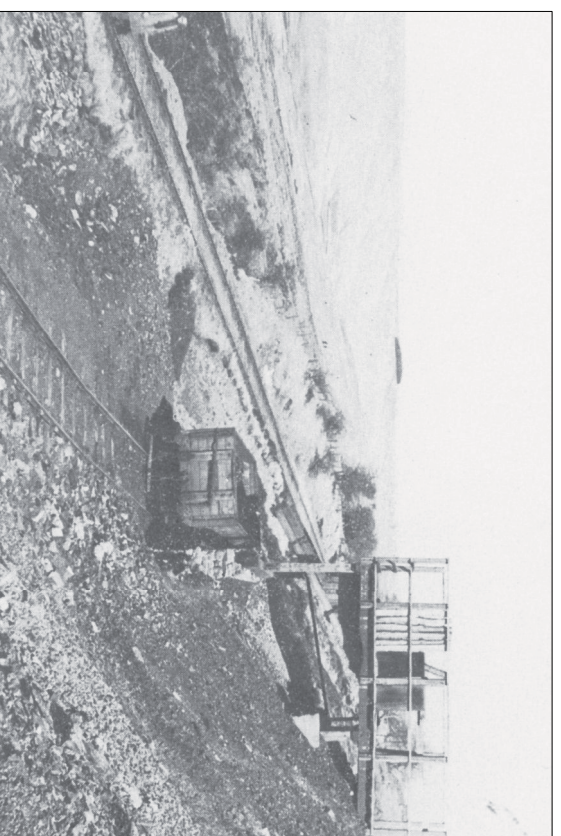
Siding and loading bay at Prior High Side Drift (Webb & Gordon, 1978)