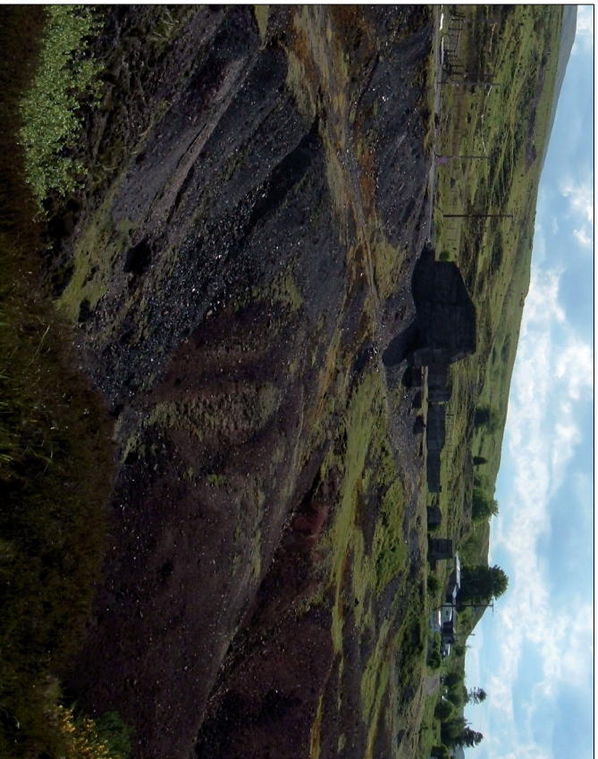
Structures and spoil from the former Tindale Zinc Extraction Ltd