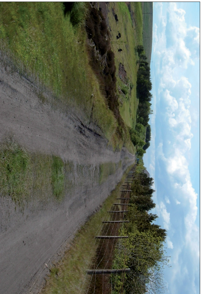
The route of the cyclepath along the top of the "Great Battery"