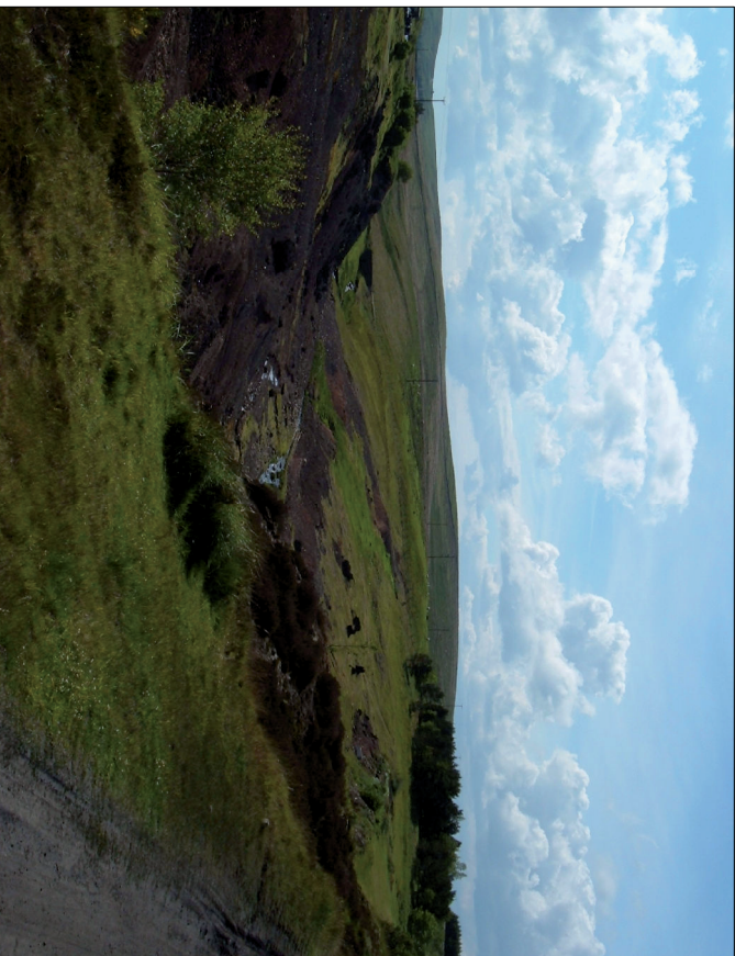
Quarry and spoil tips at Tindale