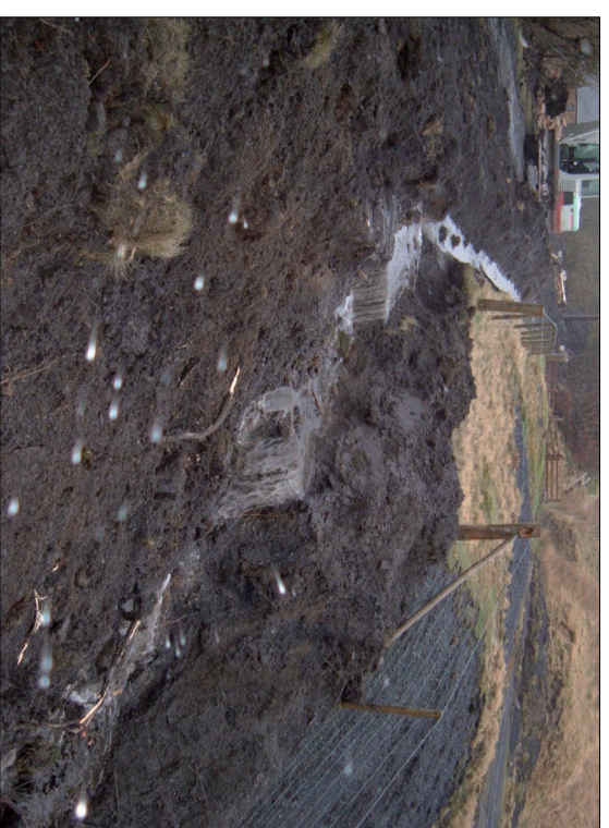
The core of the embankment being exposed through erosion caused by water run-off