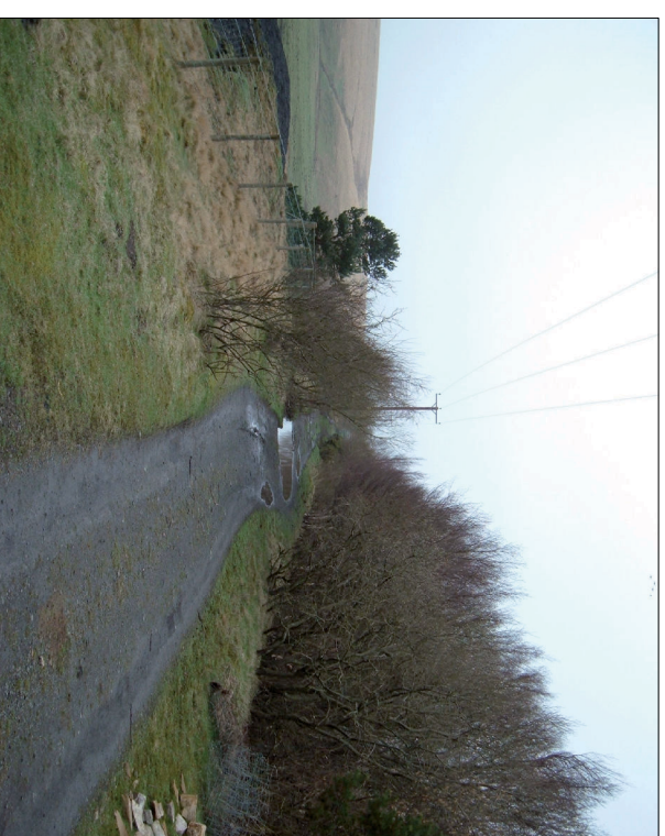
View west along top of embankment prior to excavation of cyclepath