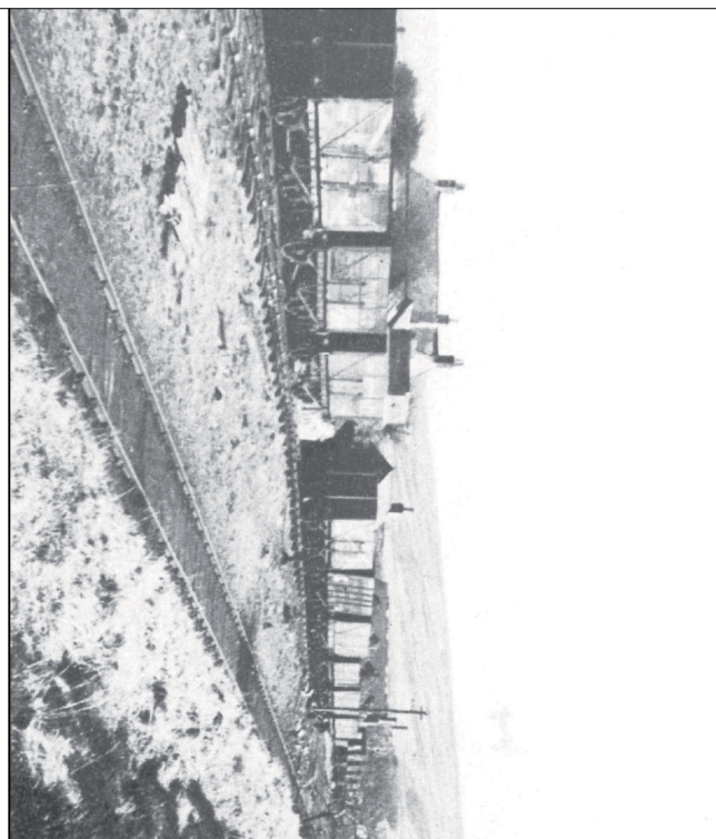
Rail wagons standing at the loading bay of Whites Cut (Webb & Gordon, 1978)