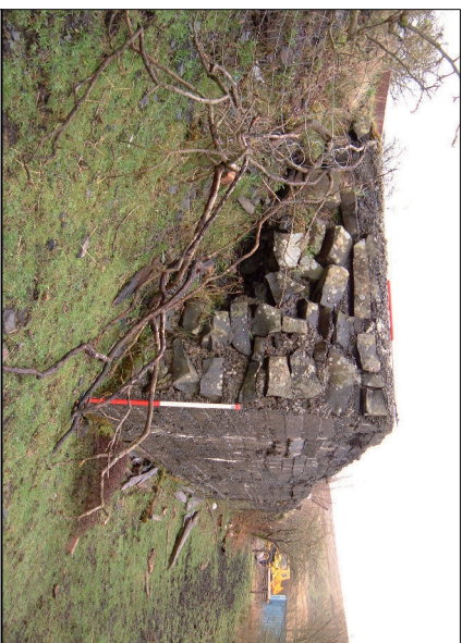
Detail of the loading bay structure