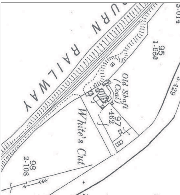
2nd Edition Ordnance Survey (1900)