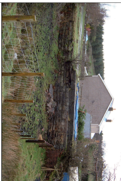
The remains of the loading bay at Whites Cut