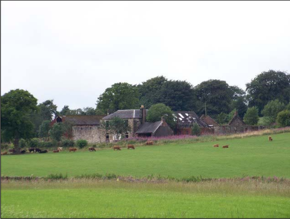
Figure 2a: Historic photo illustrating the standing but derelict dwellings of Drumcross Farm