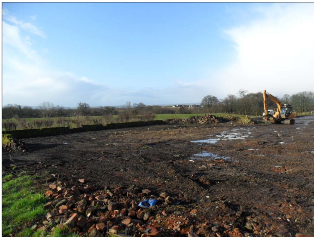
Figure 1b: Post-excavation shot over the area for the new farm manager's house and where one of the previous dwellings had been located