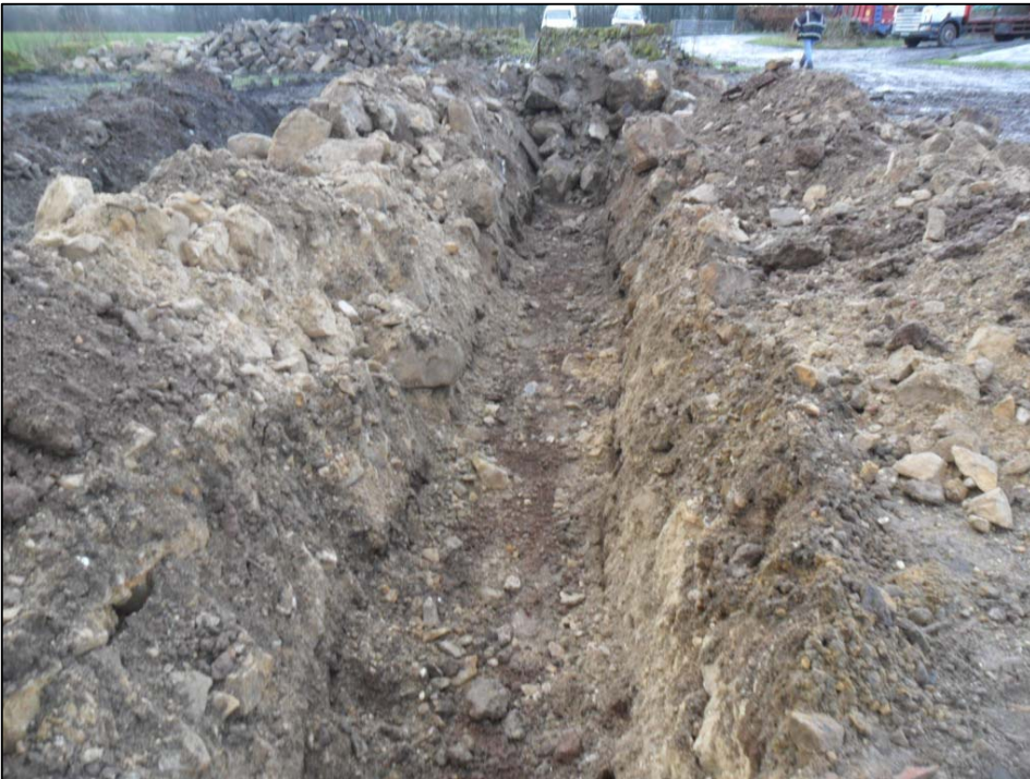
Figure 2b: Trench showing the stone and yellow sand mix of the floating foundations (003) sitting on top of the red pink sandy clay natural (002).