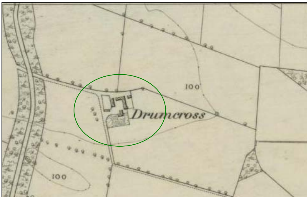
Figure 1a: 1 st Ordnance Survey Edition (Surveyed 1857)