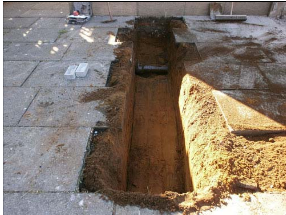
Figure 3b: Eastern foundation Trench from the North