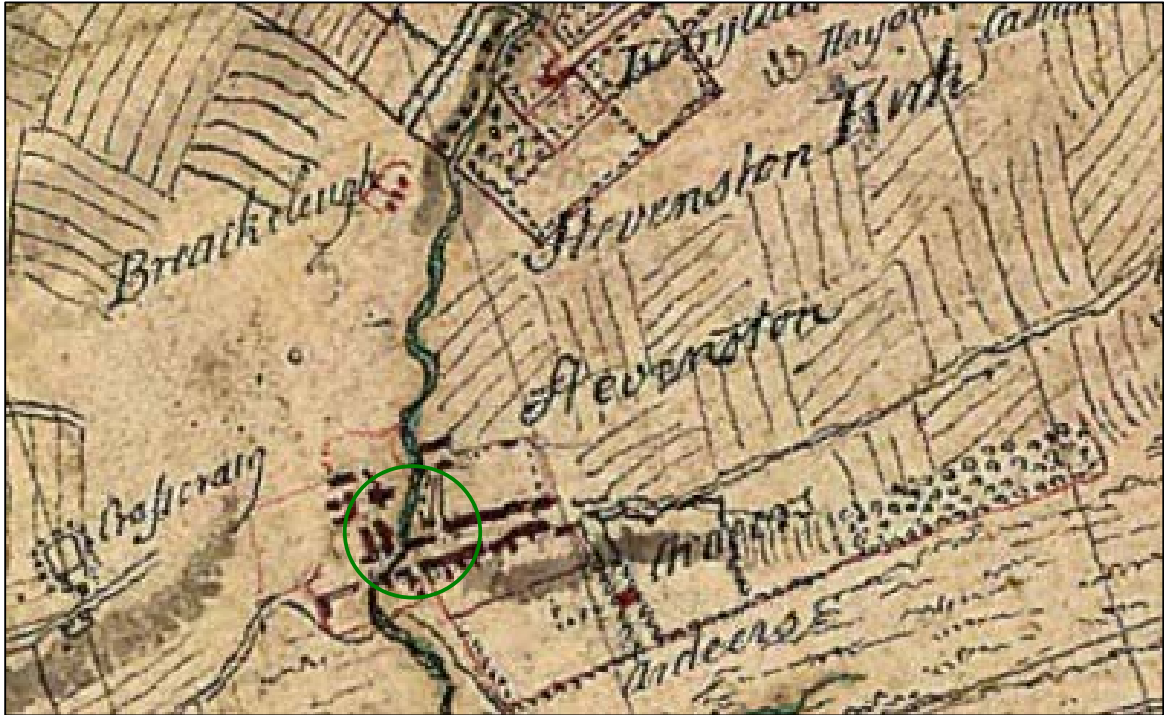
Figure 1a: Roy's Military Survey Lowlands 1747-55