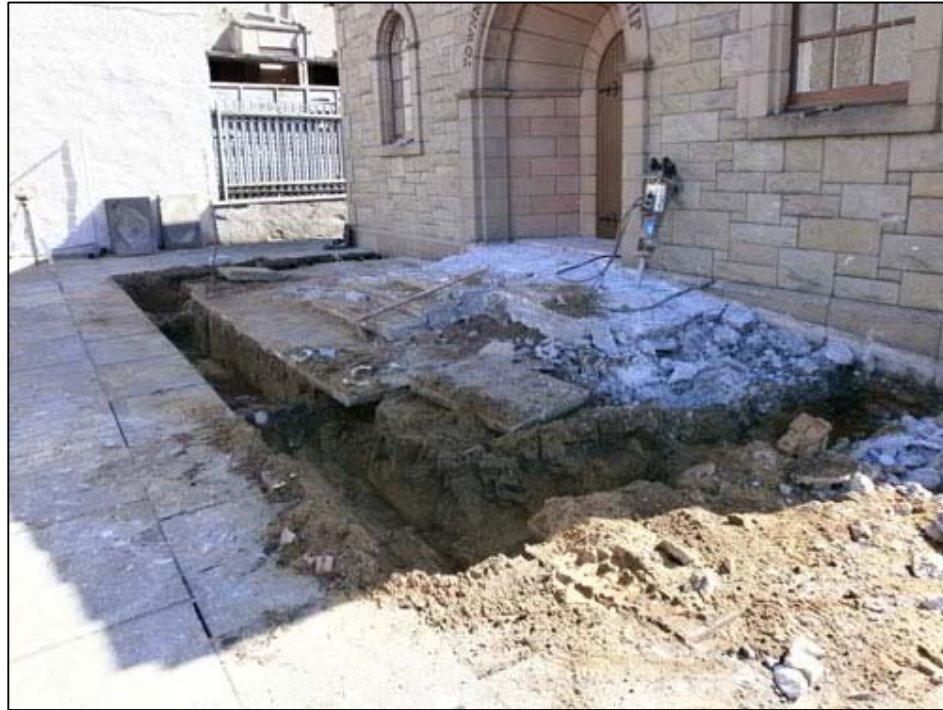
Figure 3a: General Shot with outside foundation trenches excavated from the North West