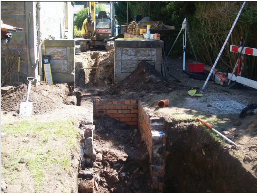
Figure 3b: General shot looking East towards Area 2 Pipe Trench