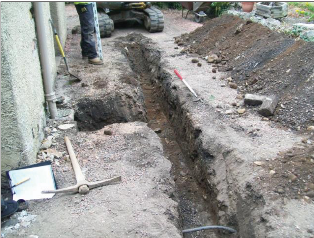
Figure 4b: General Working Shot looking North-northeast along N-S leg of Pipe Trench Area 3