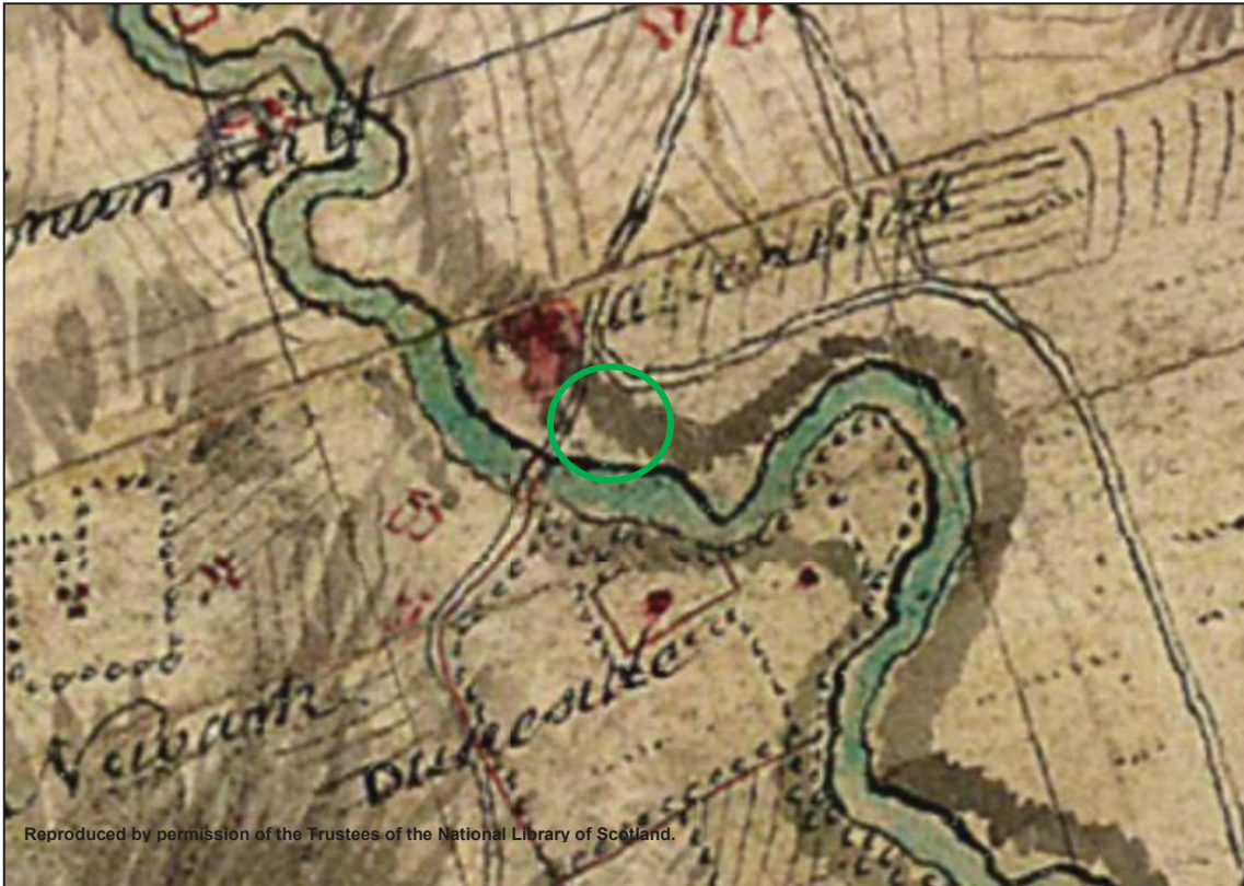
Figure 1a: Roy's Military Survey (Lowlands 1752-55)