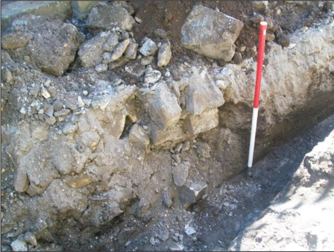
Figure 4a: Oblique of North Facing Section of Pipe Trench in Area 2 showing Wall founds of 'Green House' (East side)