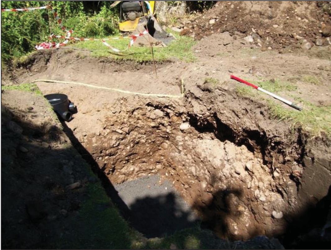
Figure 3a: General Shot Post Ex of New Septic Tank Trench Area 1