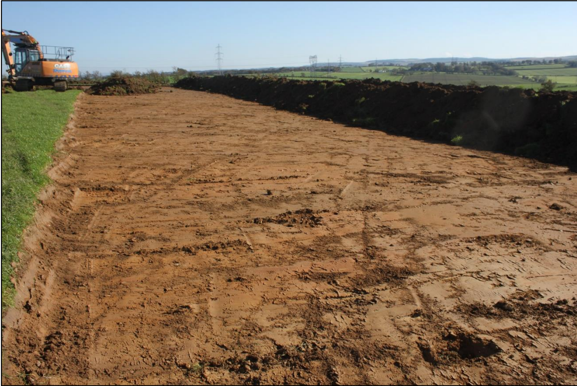
Figure 4a: Area within footprint of poultry shed with (002) exposed from the SW