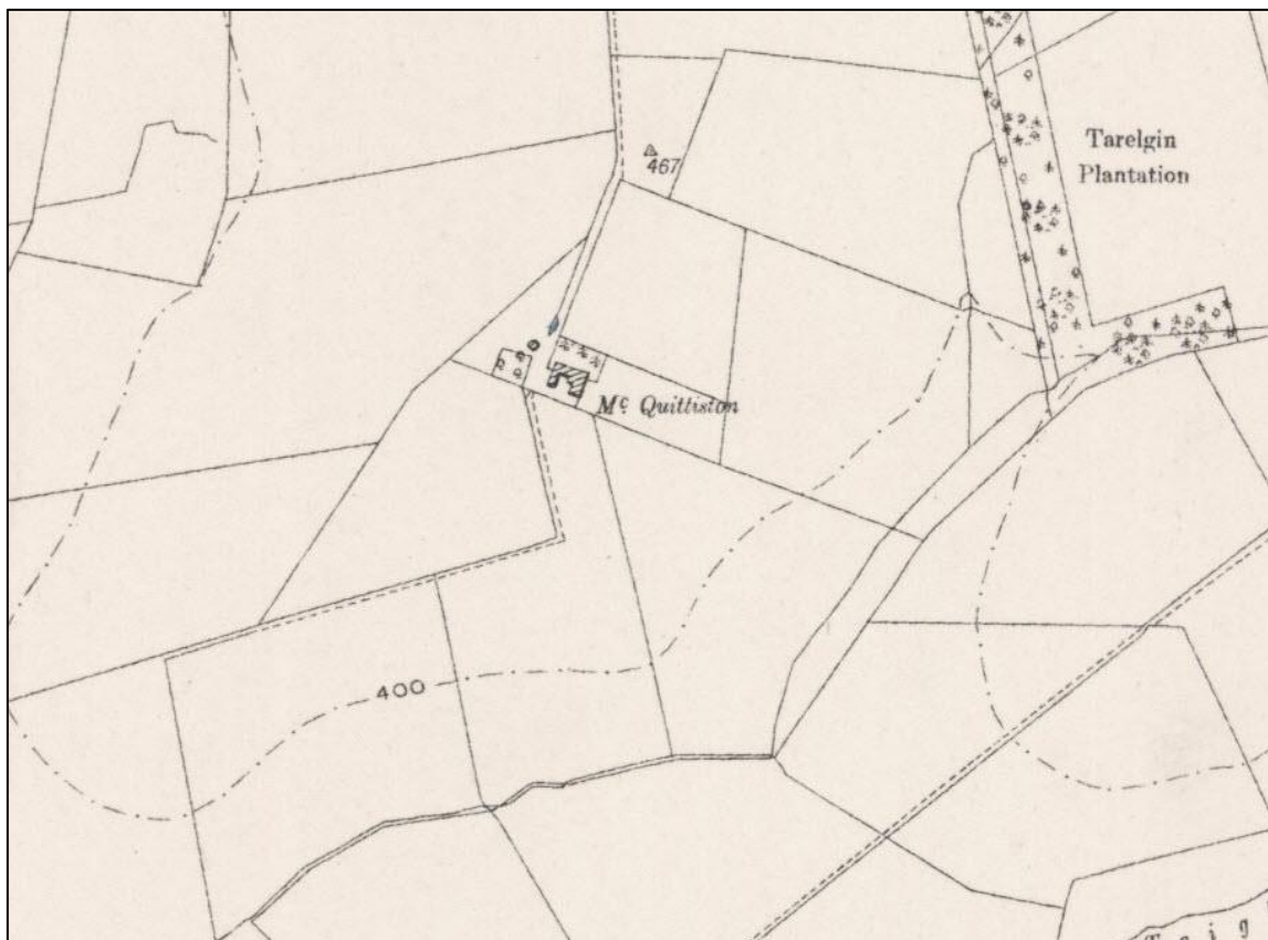
Figure 1b: Extract from 3 rd edition six-inch Ordnance Survey 1910