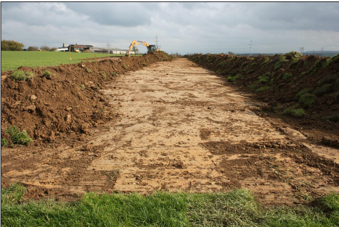
Figure 3b: Area within footprint of poultry shed with (002) exposed from the SW