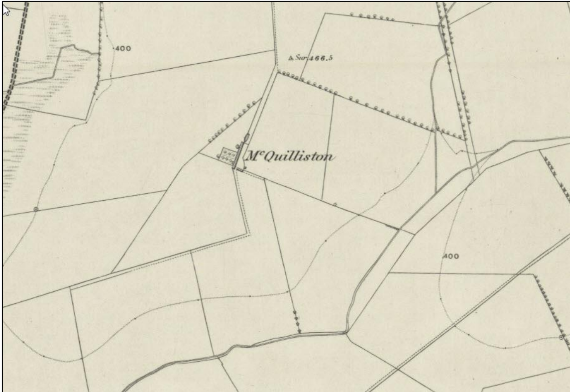
Figure 1a: Extract from 1 st edition six-inch Ordnance Survey 1860