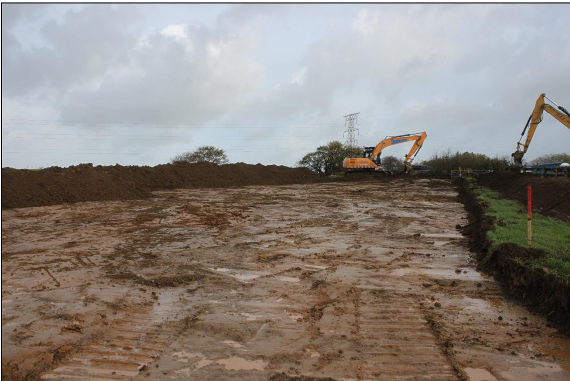
Figure 4b: Access road for poultry shed with (002) exposed from the SE