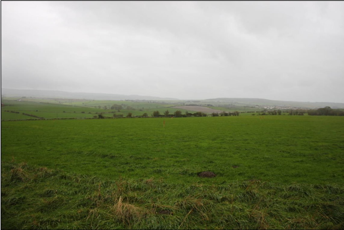
Figure 3a: Pre-excitation shot of development area from the N