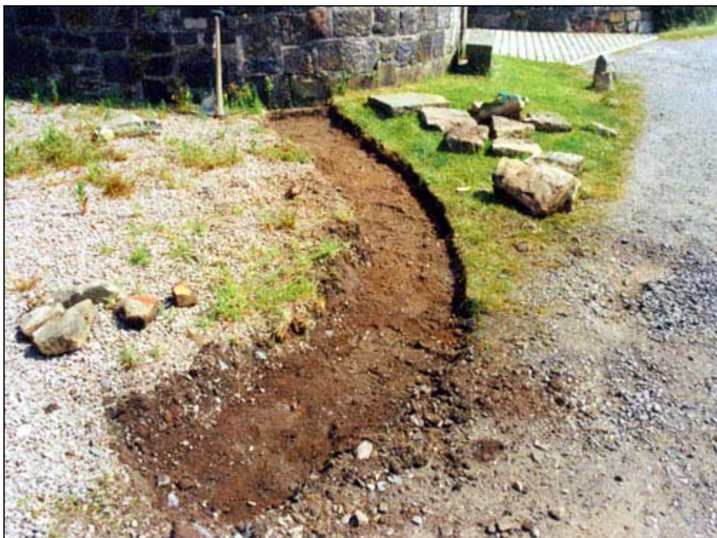
Figure 2b: East section of the foundation trench