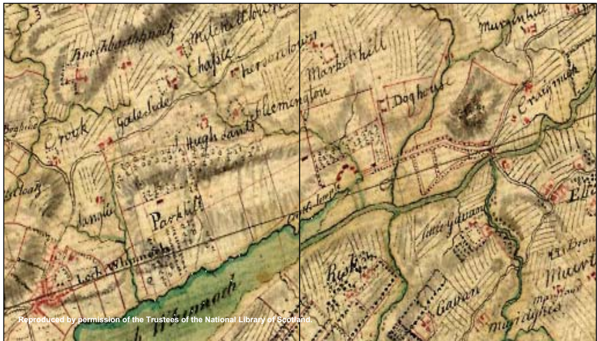
Figure 1a: Detail from Roys' Military Survey of Scotland (1747-55)