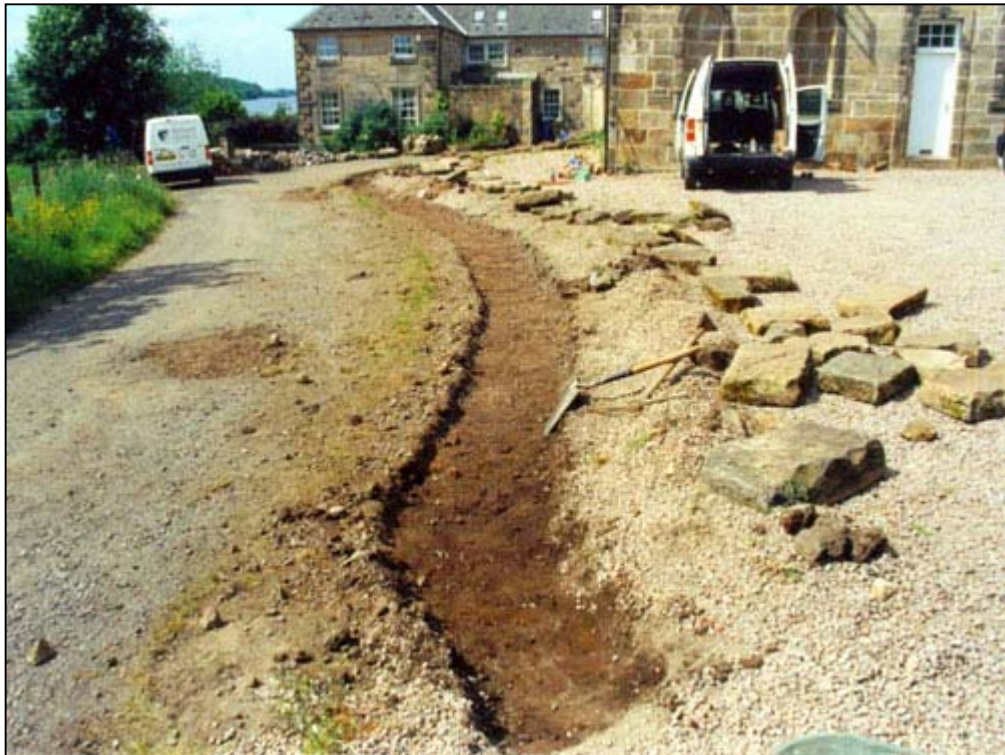
Figure 2a: West section of the foundation trench