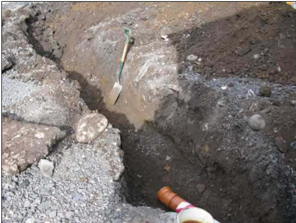
Fig. 3b: Area 1 (Farmyard): Drainage Track, Post-Excavation