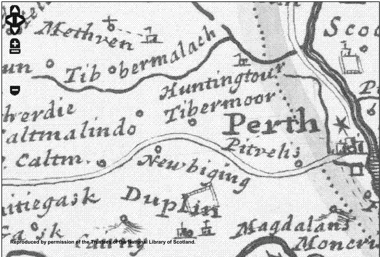
Fig. 1a: Moll's Map of 1745 Showing the Huntingtower Castle