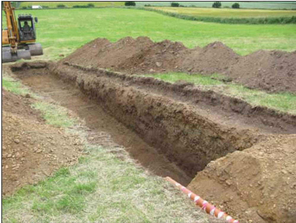
Fig. 5b: Area 2 (Field): Site of Soakaway, Fully Excavated