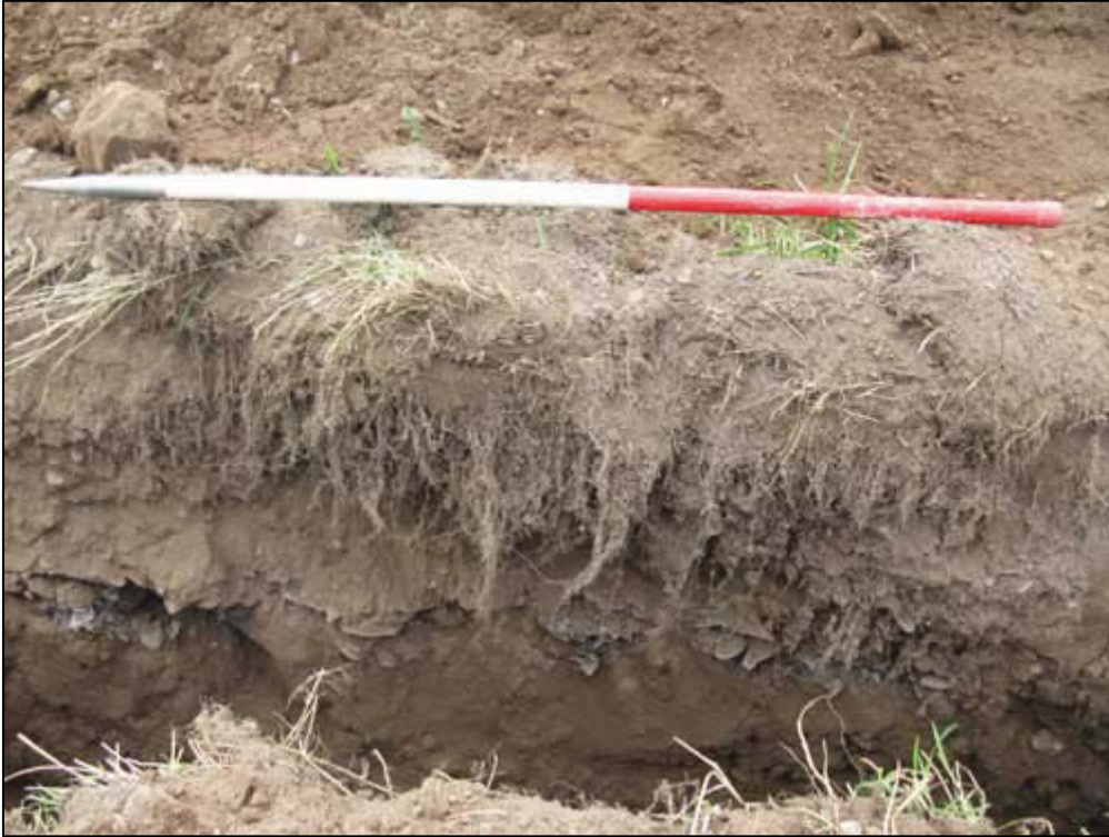
Fig. 6a: Shallow Scoop [104] With Layer of Broken Slates (105) Above