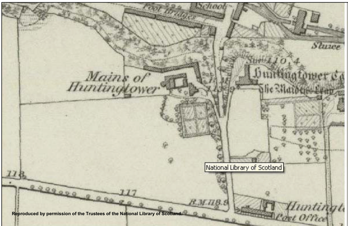
Fig. 1b: Excerpt from 1 st edition Ordnance Survey Map of 1890