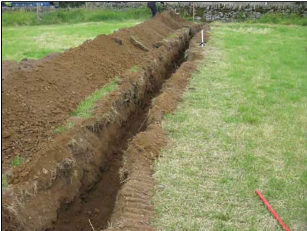
Fig. 4b: General View of Area 2, N end (where works crossed Scheduled Area).