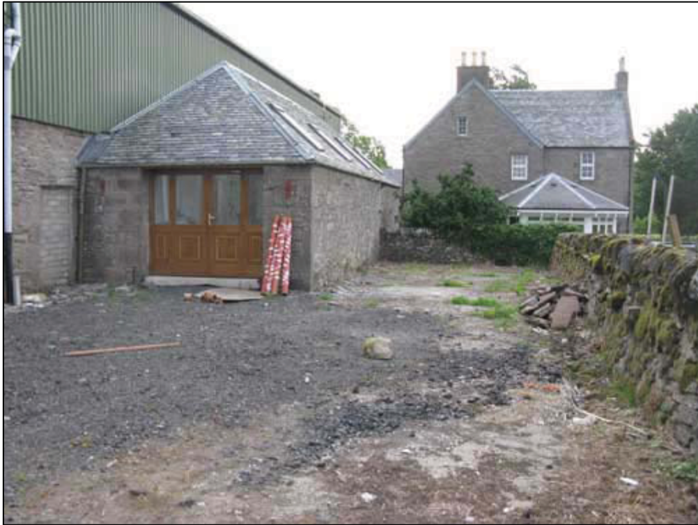
Fig. 3a: Area 1 (Farmyard) – Pre-Excavation