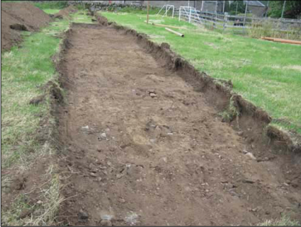
Fig. 5a: Area 2 (Field) : Footprint of Soakaway, Topsoil stripped.