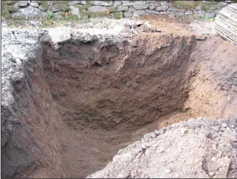
Fig. 4a: Area 1 (Farmyard): Pit for Septic Tank