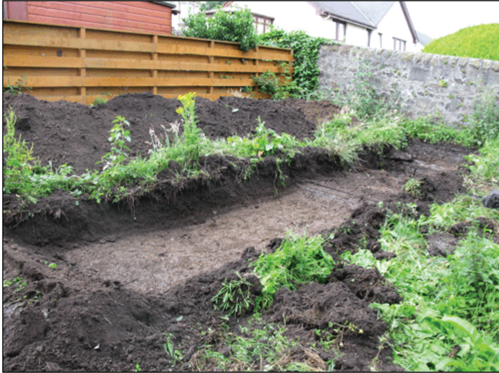
Figure 4a: Mid-ex shot showing partial stripping