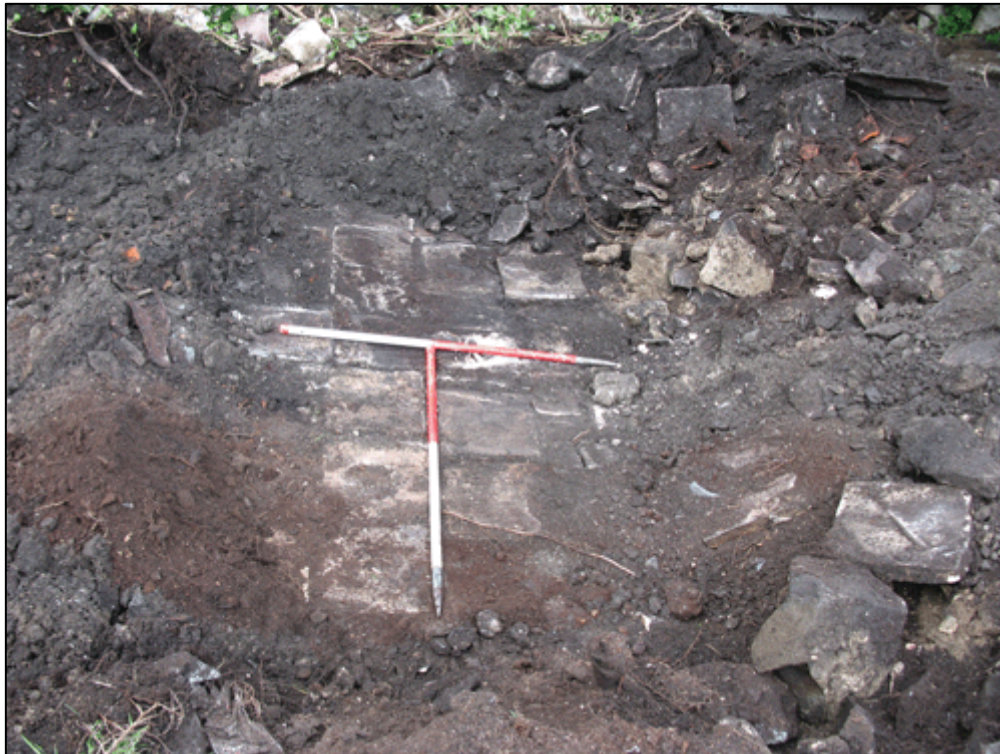
Figure 6a: Shot of (008) paving surface