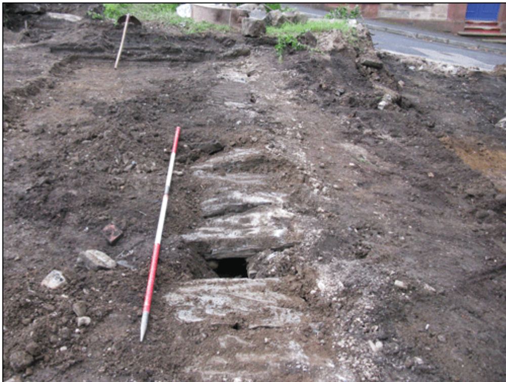
Figure 6b: Shot of stone culvert (005) facing site entrance