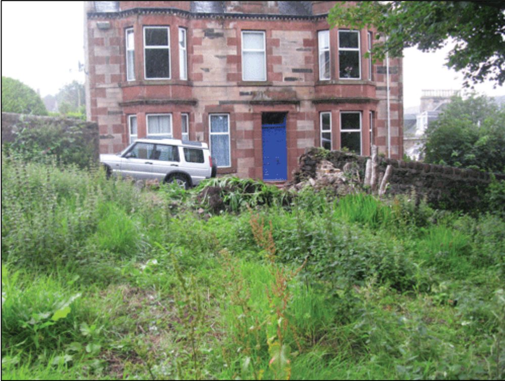
Figure 3a: Pre-ex shot of site facing entrance from Bogany Road