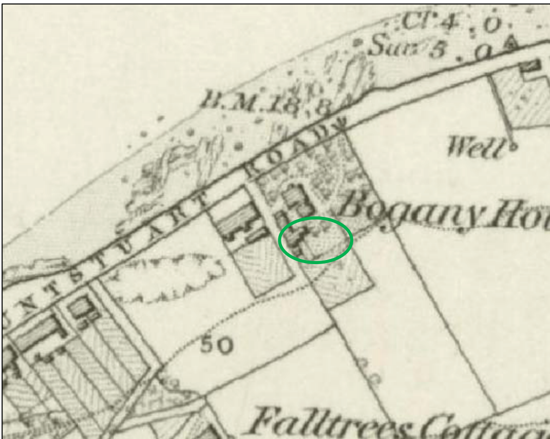
Figure 1b: Detail from 1 st edition Ordnance Survey (1869)