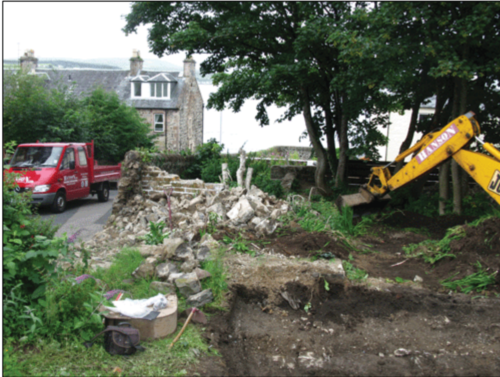
Figure 5a: Shot of area immediately east of site entrance