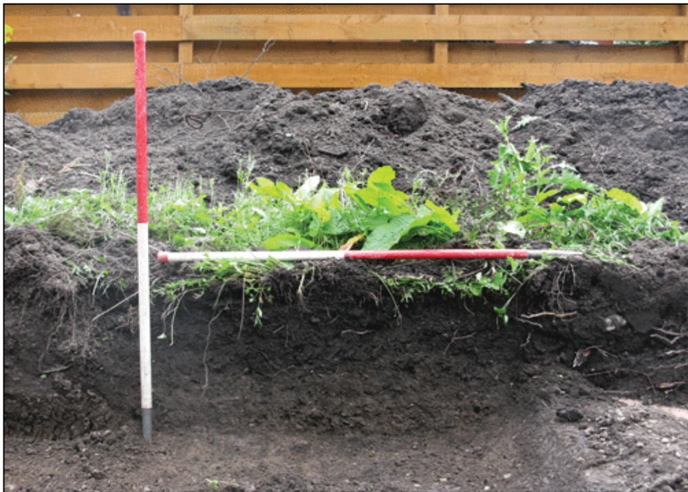
Figure 4b: Northwest facing section of stripped area