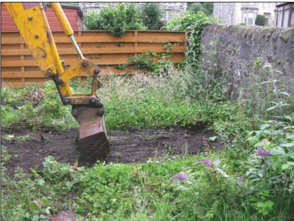
Figure 3b: Mid-ex shot showing topsoil stripping