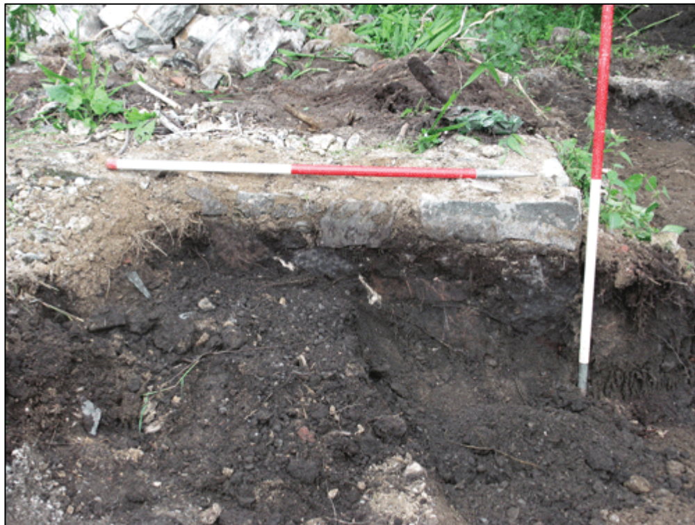
Figure 5b: Shot of wall (007)