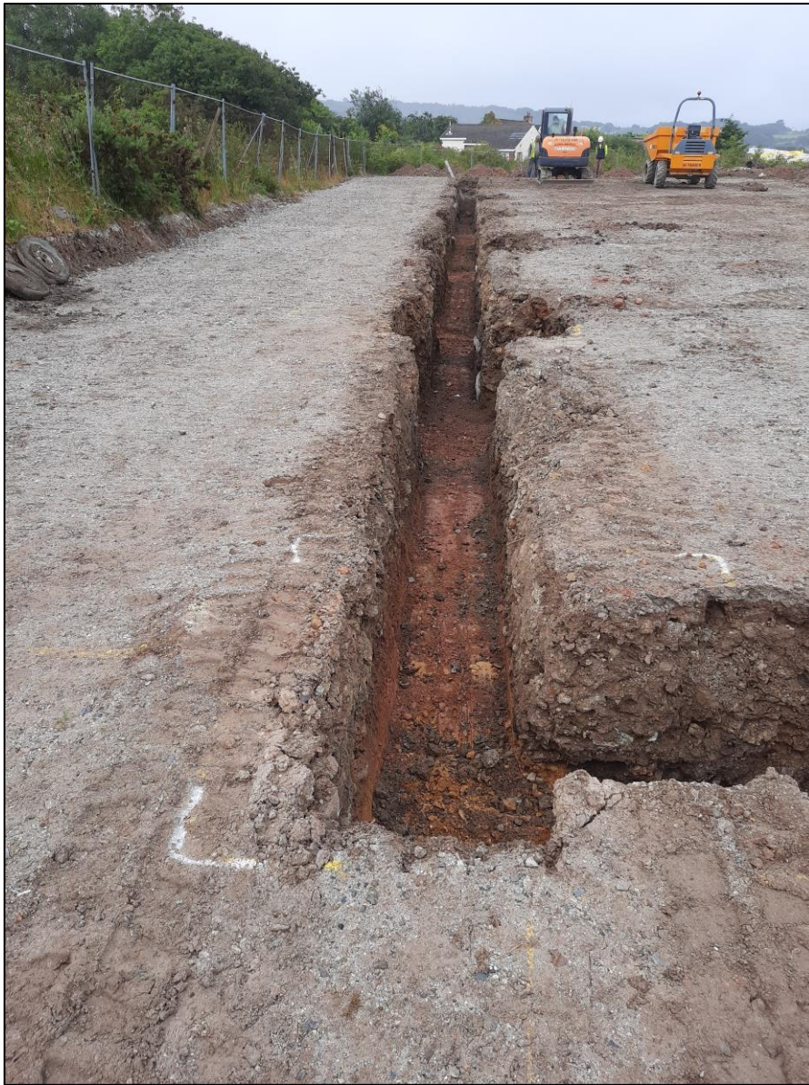
FIGURE 2: EASTERN FOUNDATION TRENCH, VIEWED FROM THE NORTH-EAST (NO SCALE).