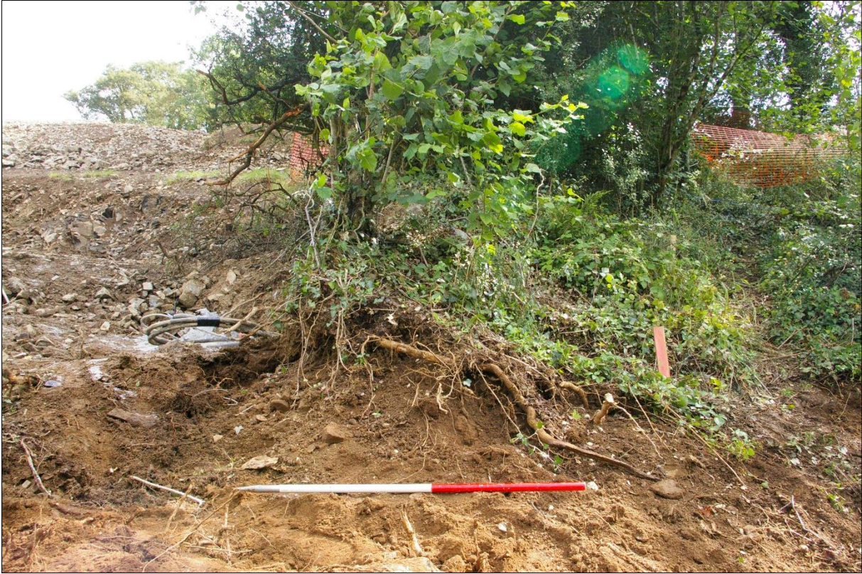
FIGURE 2: SECTION THROUGH THE HEDGEBANK; FROM THE WEST (1M SCALE).