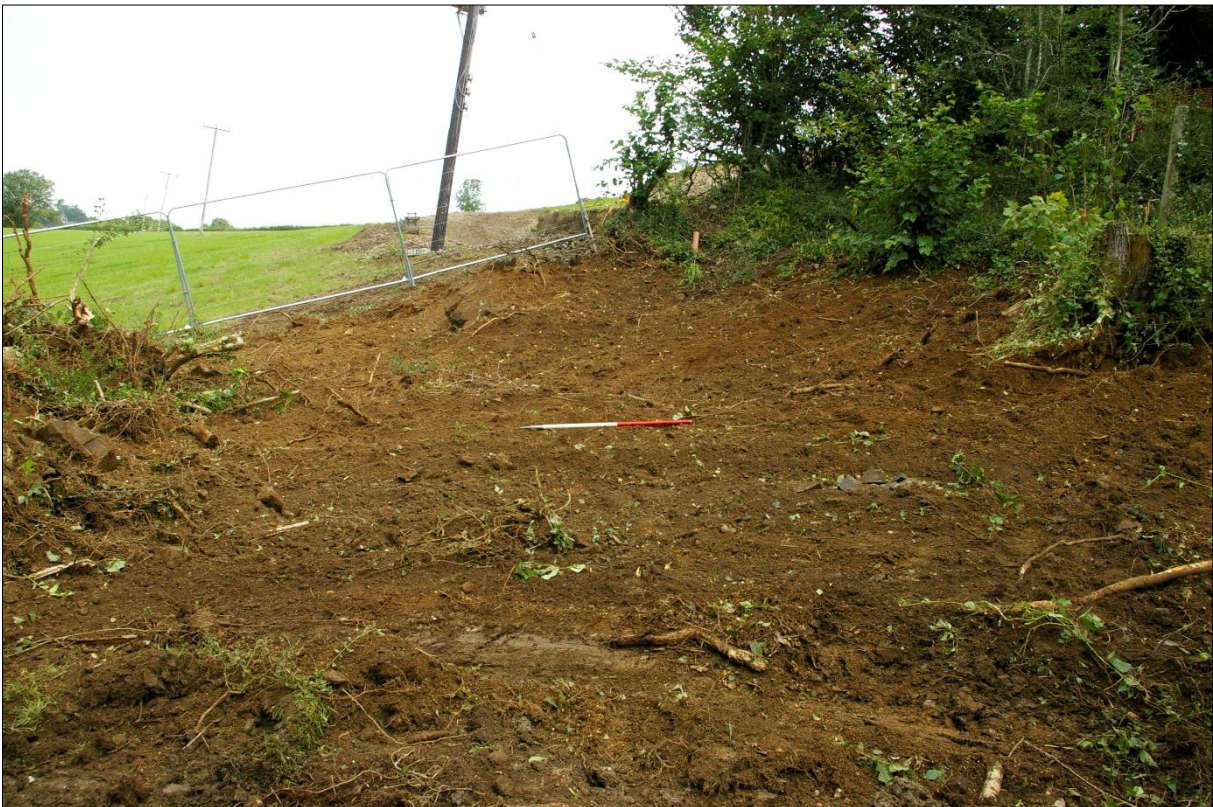
FIGURE 3: AREA STRIP; FROM THE SOUTH (1M SCALE).