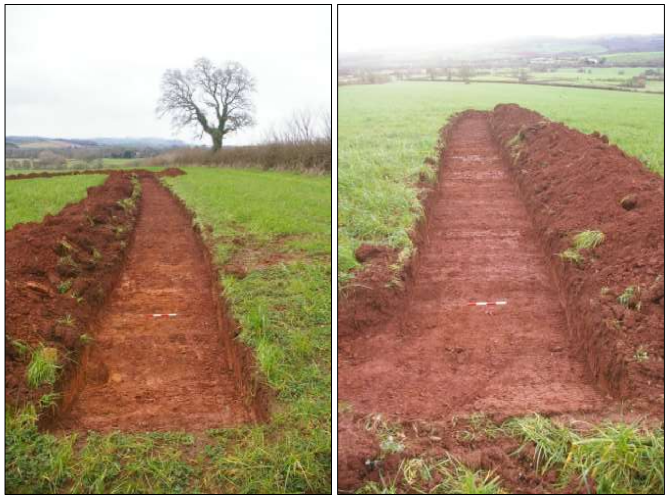
FIGURE 2: LEFT: TRENCH 1 VIEWED FROM THE NORTH-EAST (0.4M SCALE). RIGHT: TRENCH 2 VIEWED FROM THE NORTH-WEST (0.4M SCALE).