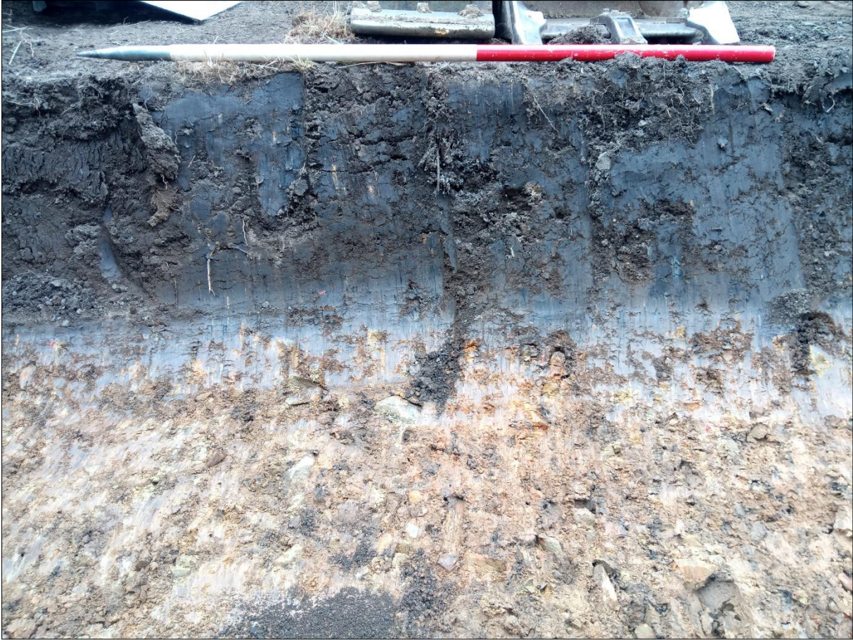
FIGURE 2: SAMPLE SECTION; FROM THE NORTH-EAST (1M SCALE).