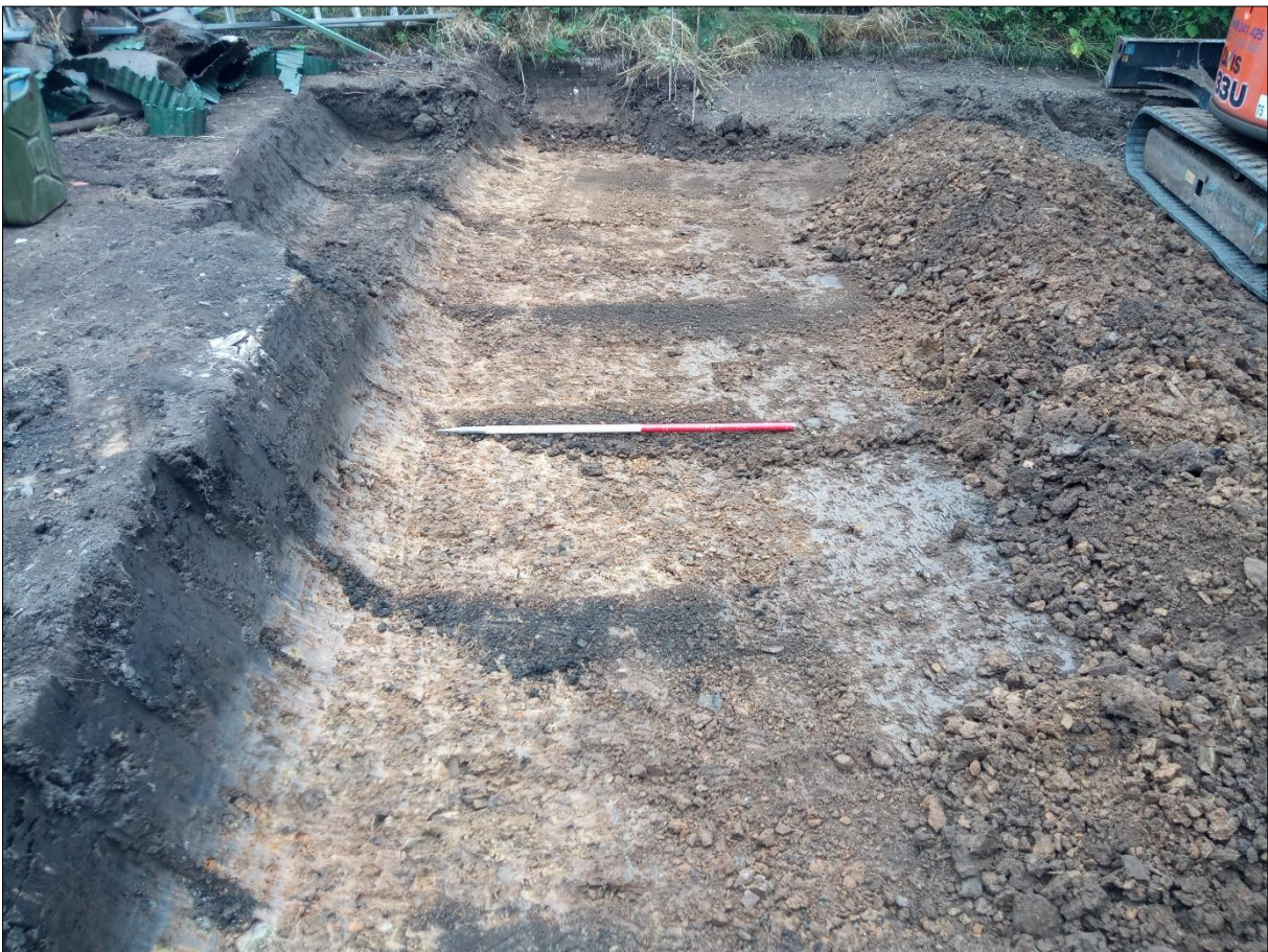
FIGURE 3: STRIP OF EXPOSED NATURAL (101), WITHIN AREA STRIP; FROM THE SOUTH-EAST (1M SCALE).