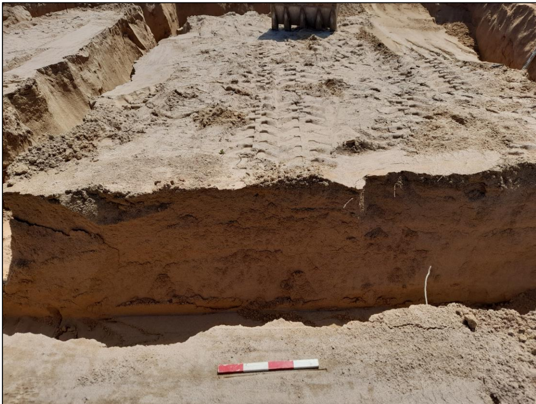
FIGURE 3: NORTH-WEST FACING SECTION, VIEWED FROM NORTH-WEST (0.4M SCALE).