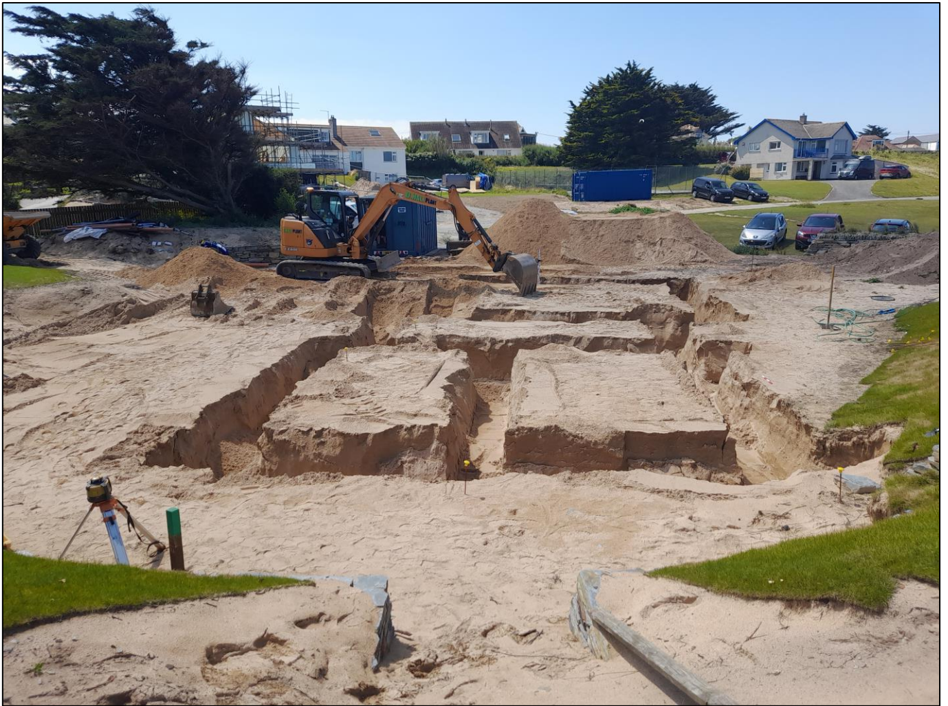
FIGURE 2: REPRESENTATIVE SHOT OF THE FOOTING EXCAVATIONS, FROM THE NORTH-EAST (NO SCALE).