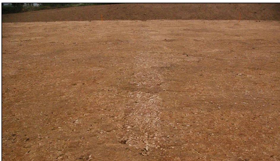
FIGURE 3: MODERN SERVICE TRENCH; VIEWED FROM THE NORTH.