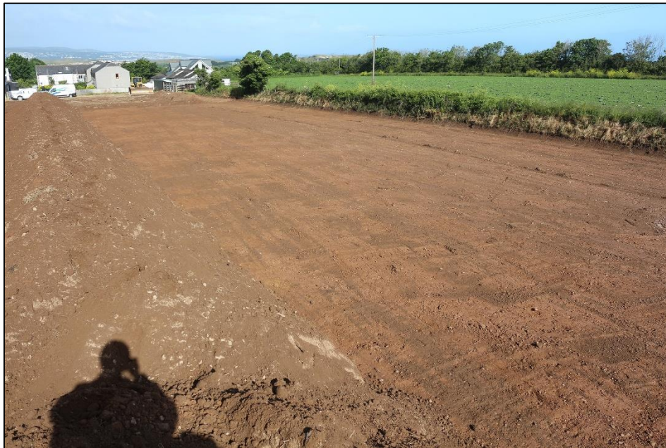
FIGURE 2: THE NORTHERN STRIPPED AREA; VIEWED FROM THE ESE; NOTE THE PLOUGH SCARS.