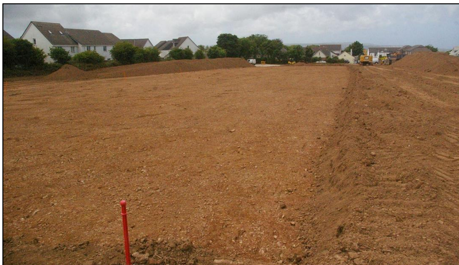
FIGURE 3: THE SOUTHERN STRIPPED AREA; VIEWED FROM THE ENE.