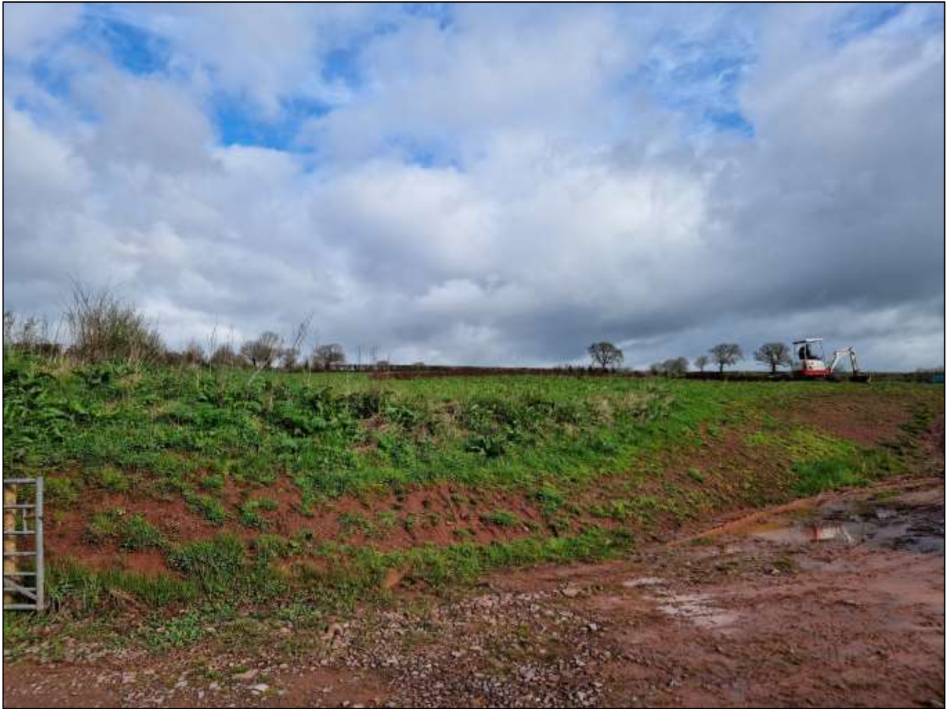
FIGURE 2: SITE VIEWED FROM EXISTING YARD/DRIVE TO THE SOUTH (NO SCALE). MACHINE LOCATED IN POSITION OF EASTERN TRENCH.