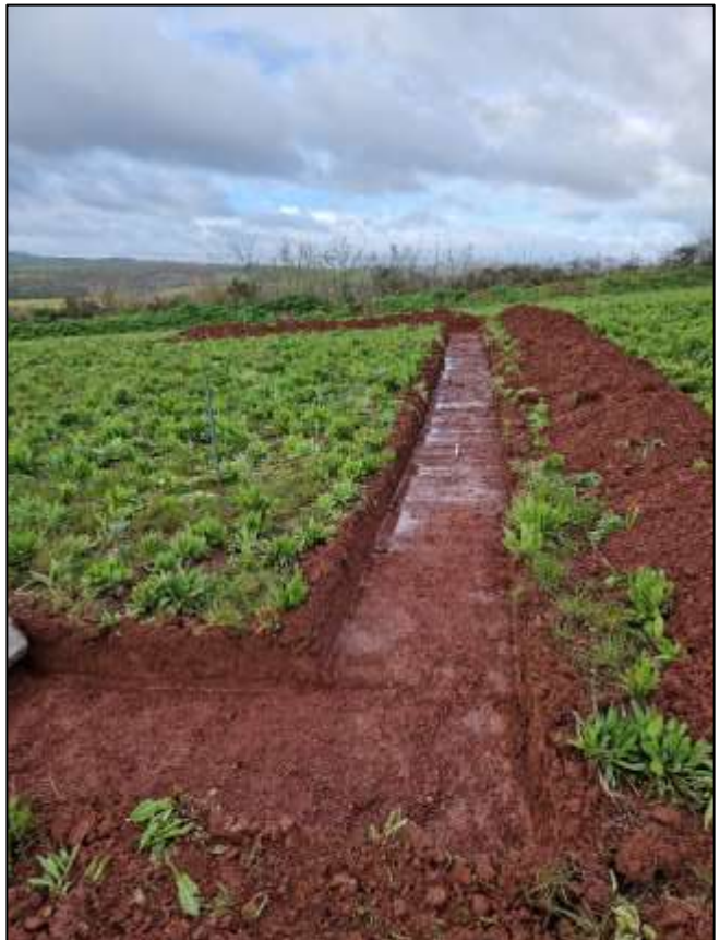
FIGURE 3: LEFT – EASTERN TRENCH, VIEWED FROM THE SOUTH (1M SCALE). RIGHT – NORTHERN TRENCH, VIEWED FROM THE EAST (1M SCALE).