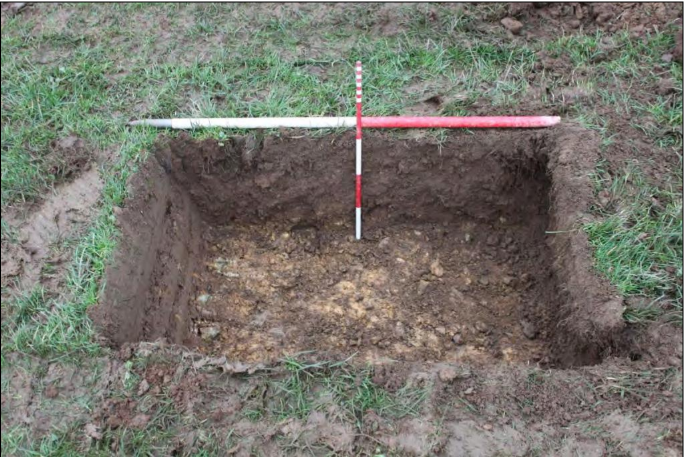
Figure 3: Trench 5, viewed from the southeast (0.5m and 1m scales).