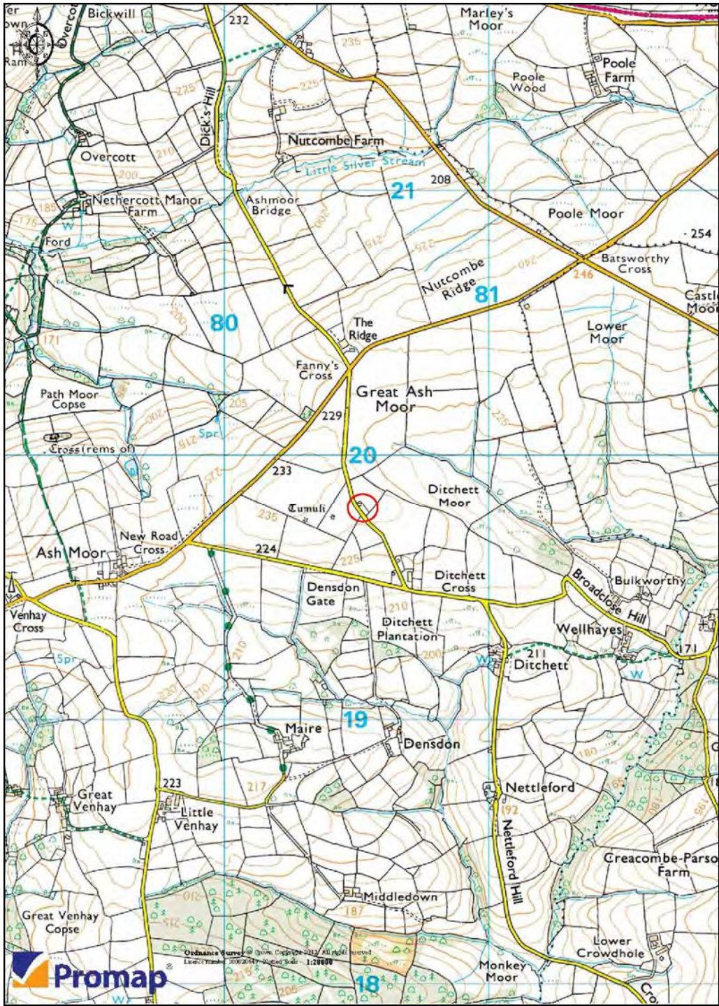
Figure 1: Site location.