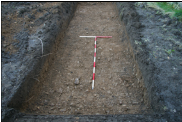
Photo 3: Trench #1: post-excavation, looking south-west (scale 1m & 2m).