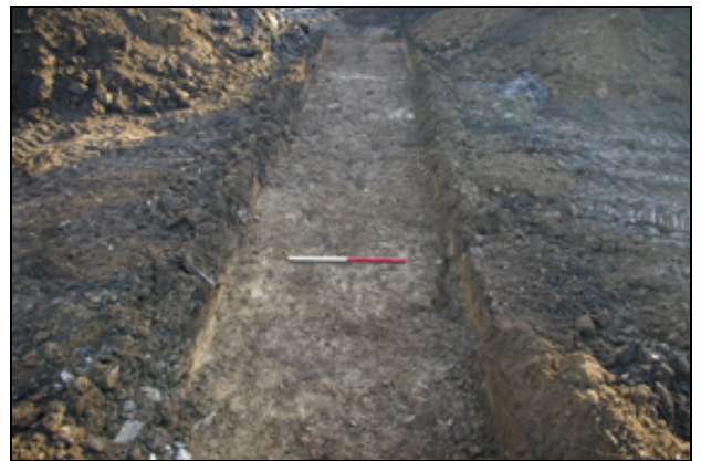
Photo 6: Trench 2: post-excavation, looking north-east (scale 1m).