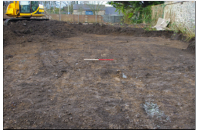
Photo 2: Eastern half of site, showing disturbed subsoil, looking south (scale 1m).