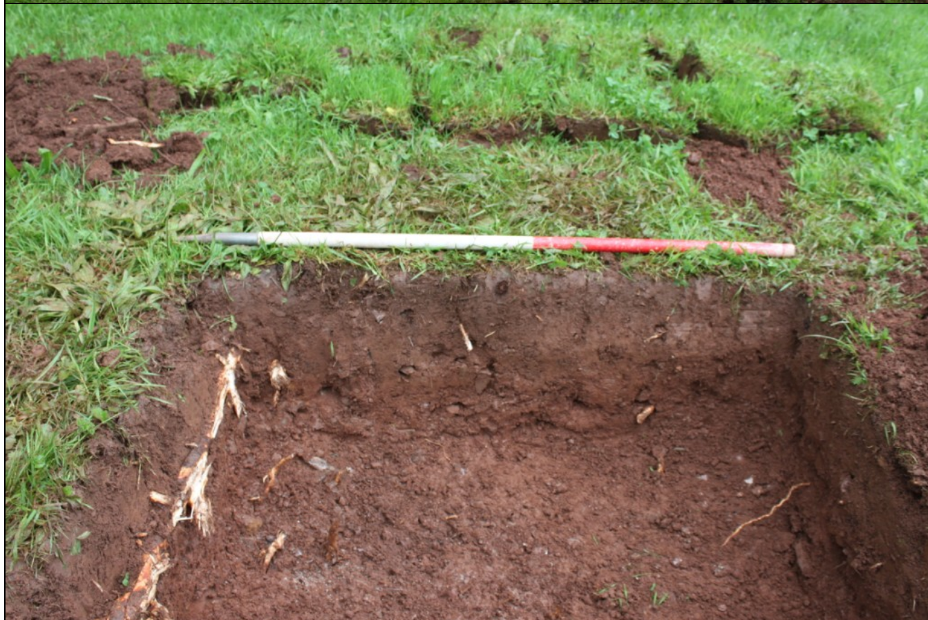
Figure 2: Above – Working shot of the Test Pits. Below – South facing section of Test Pit 1, viewed from the south (1m scale).