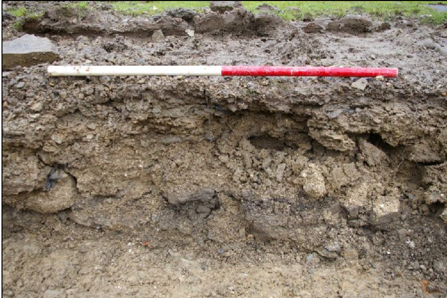
Figure 3: Sample section, Looking West (1m scale).