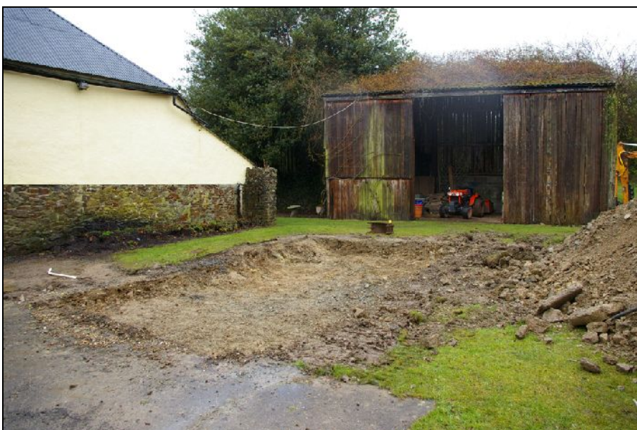
Figure 5: Site shot post-excavation, Looking North-West (no scale).