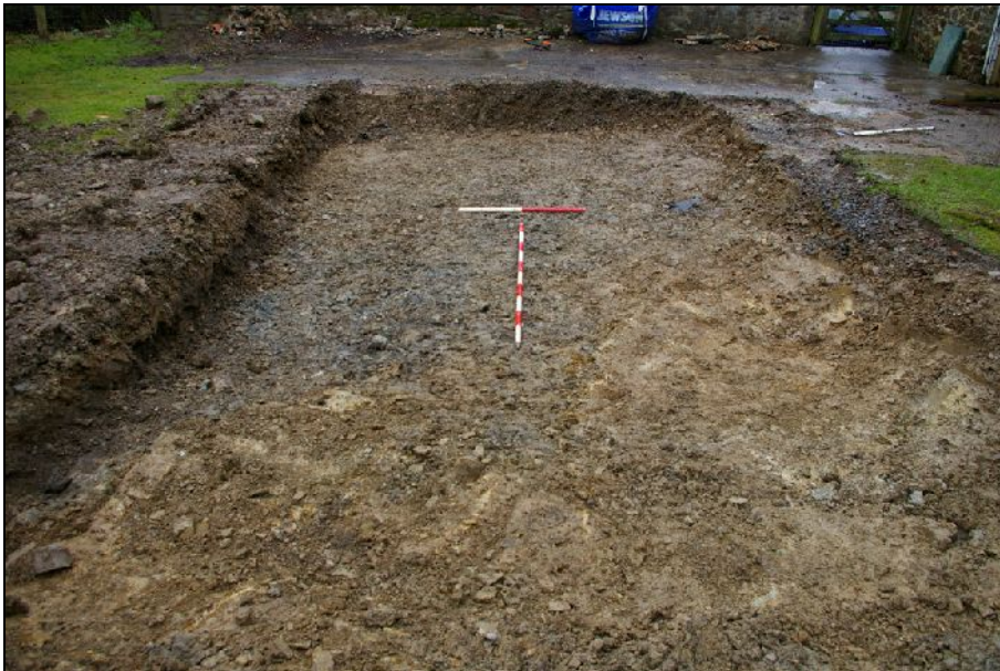
Figure 4: Swimming pool area post-excavation, Looking South (1 & 2m scales).