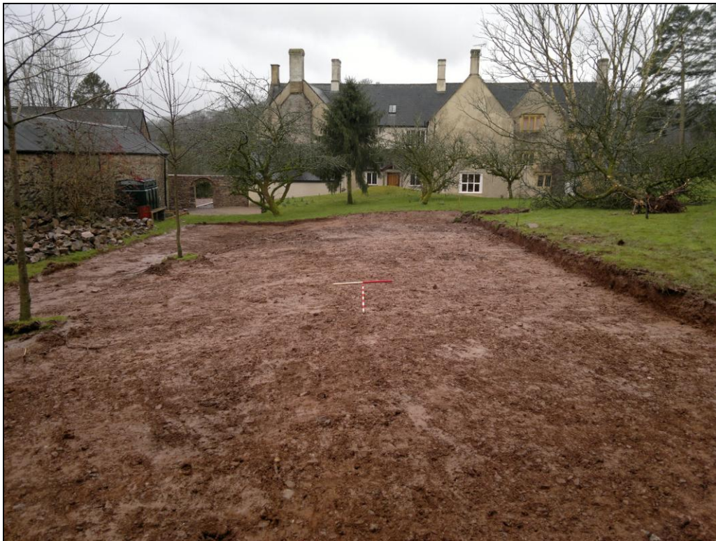
Figure 4: Site shot post-excavation, Looking South (1 & 2m scales).