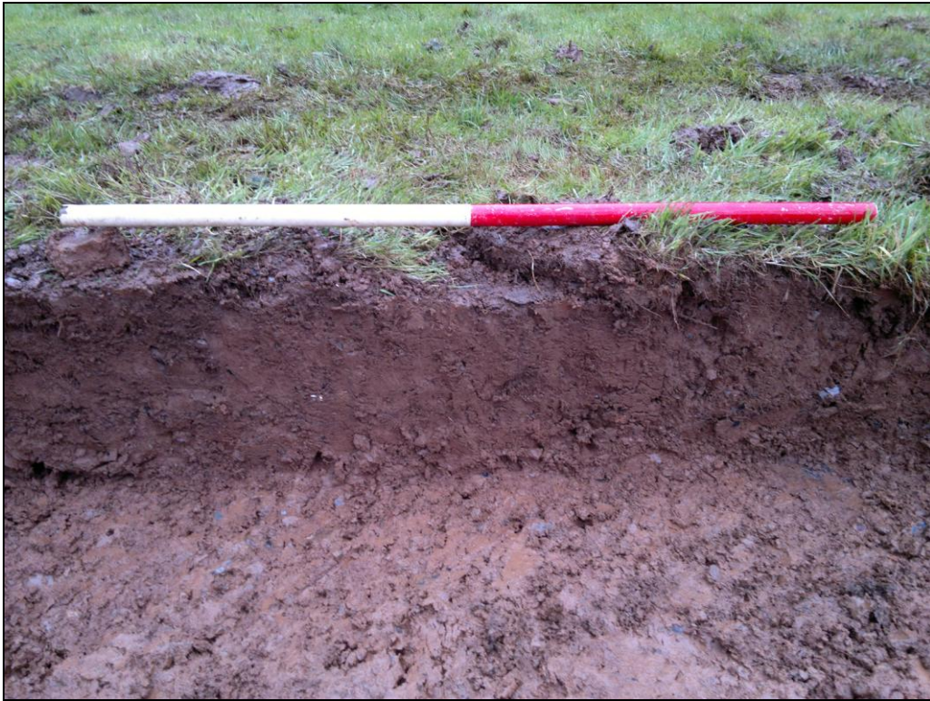
Figure 3: Sample section, Looking West (1m scale).