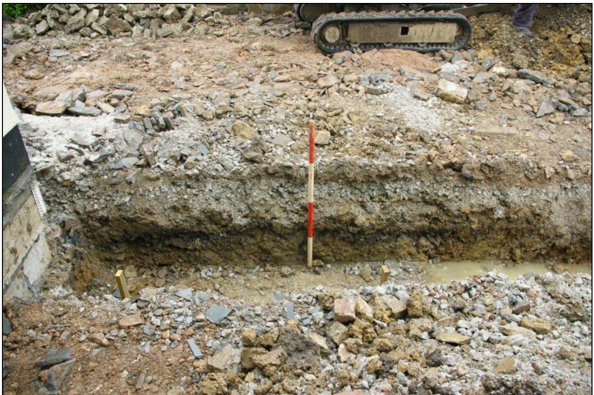
Figure 4: The excavated footing trench, viewed from the east (1m scale).