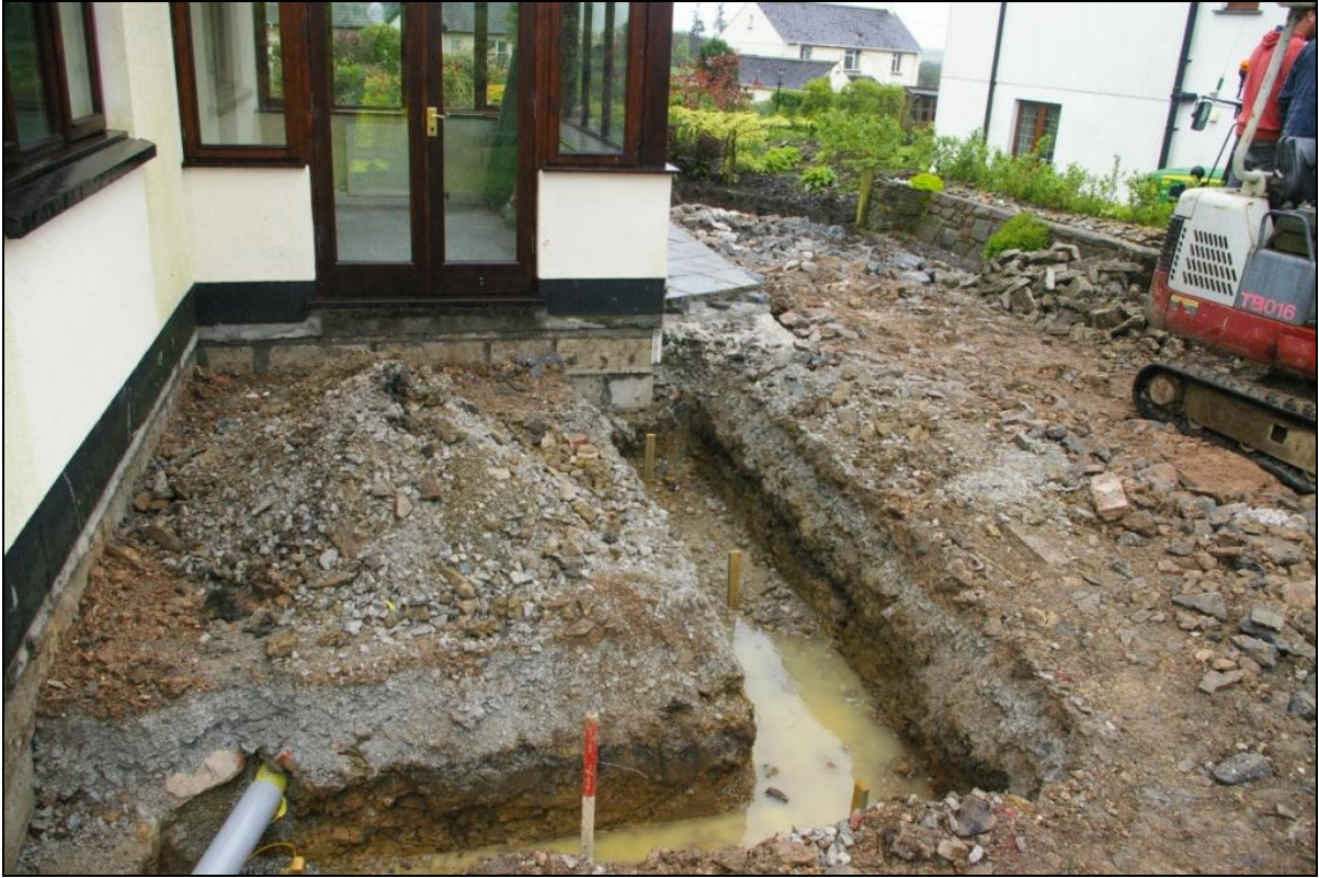
Figure 3: Shot showing the excavated footing trenches, viewed from the north (1m scale).