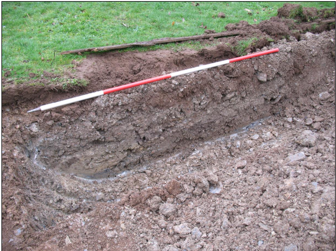
Figure 3: South facing section of trial trench; viewed from the south-west (2m scale).

Please post or email completed forms to: Strategic Historic Environment Service, Cornwall Council Pydar House, Pydar Street, Truro TR1 1XU her@cornwall.gov.uk