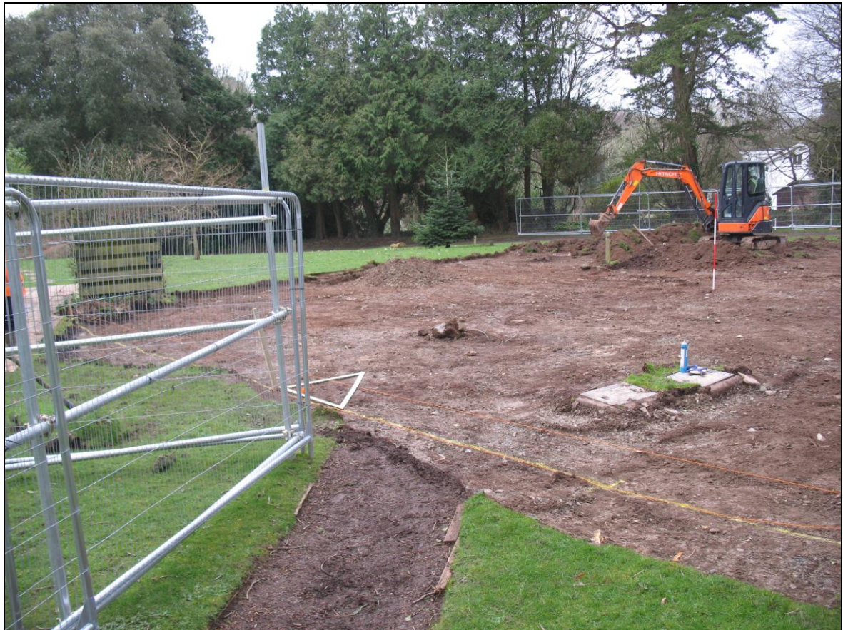
Figure 2: The excavation area; viewed from the south-west (2m scale).