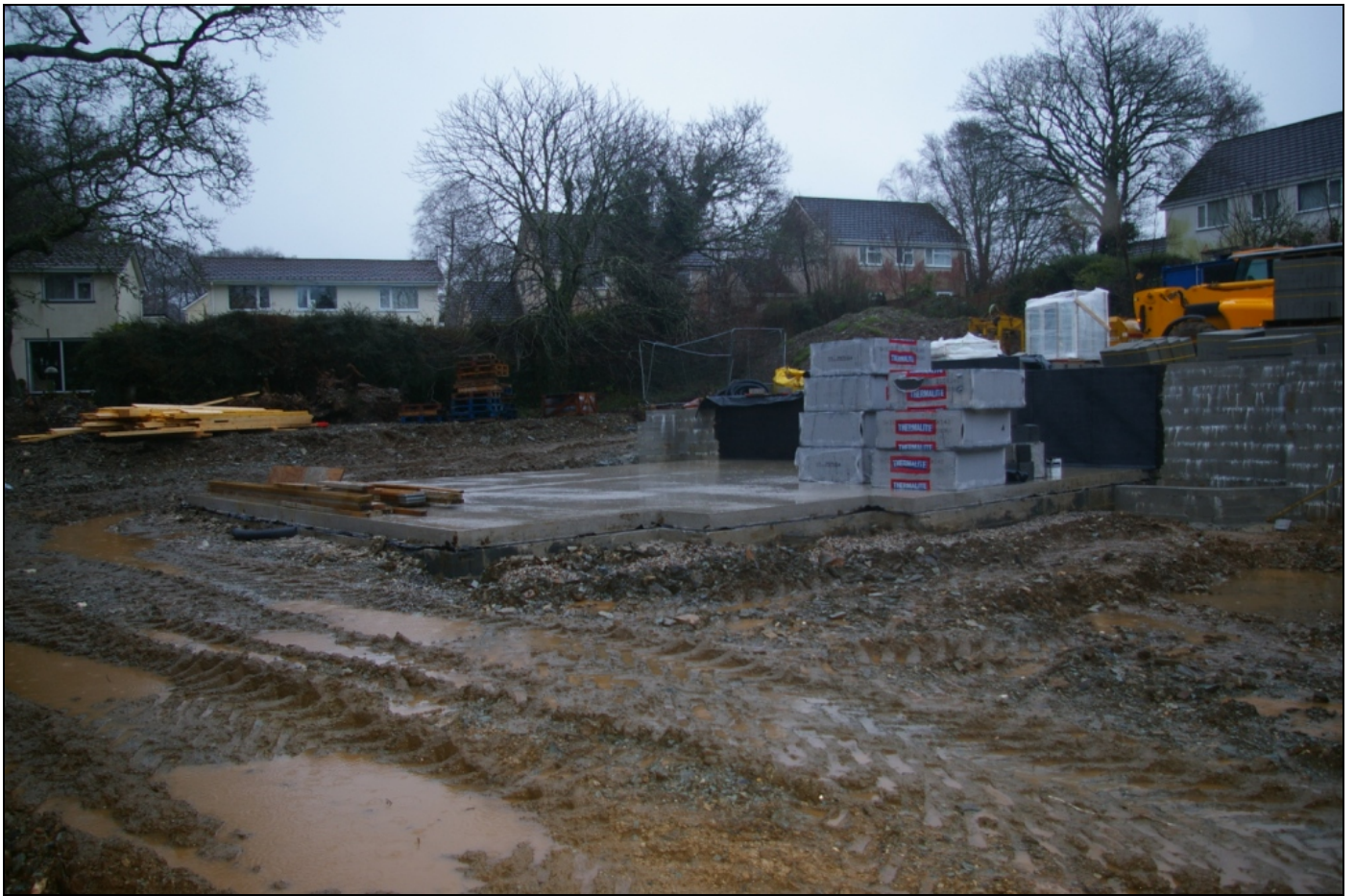
Figure 2: Shot from the centre of the site, showing extant footings and spoil heap, viewed from the northwest.