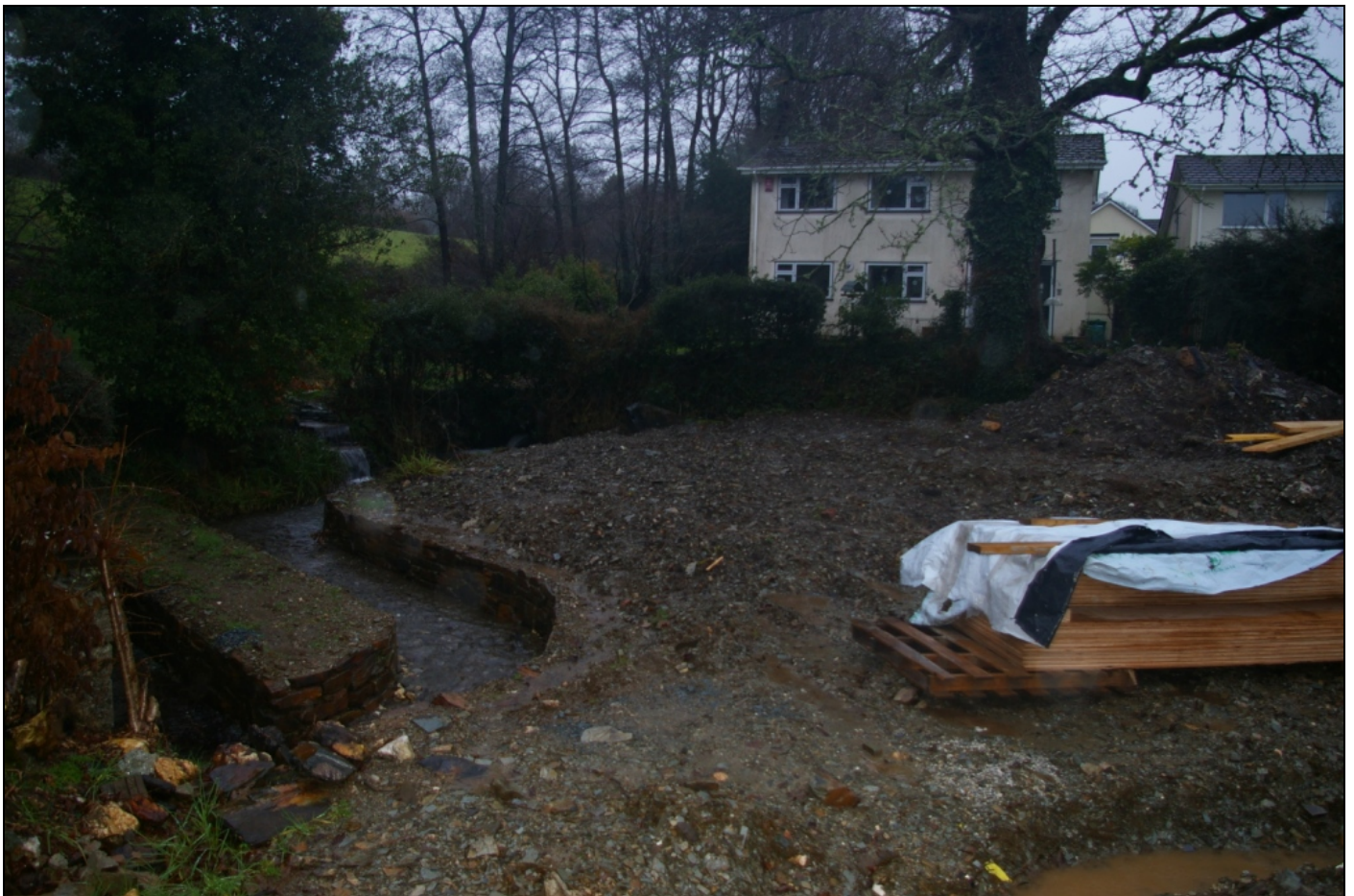
Figure 3: The small stream in the north-east corner of the site, showing the made-up ground, viewed from the west.