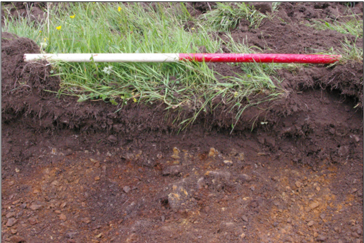
Figure 3: Sample section, viewed from west (1m scale).