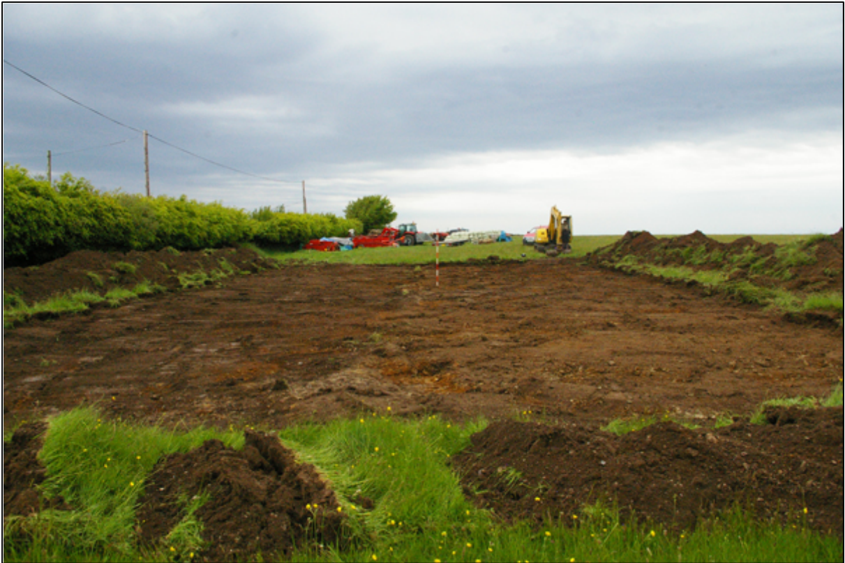
Figure 2: Site shot, post-excavation, viewed from south (2m scale).