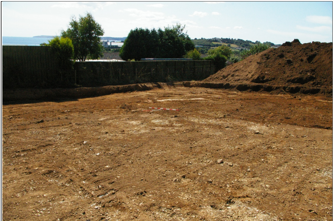
Figure 5: Post excavation view of Area 01; looking south-west (1m and 2m scales).