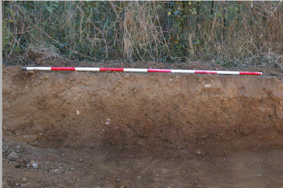
Figure 6: North facing section of Area 01, east end; looking south (2m scale)